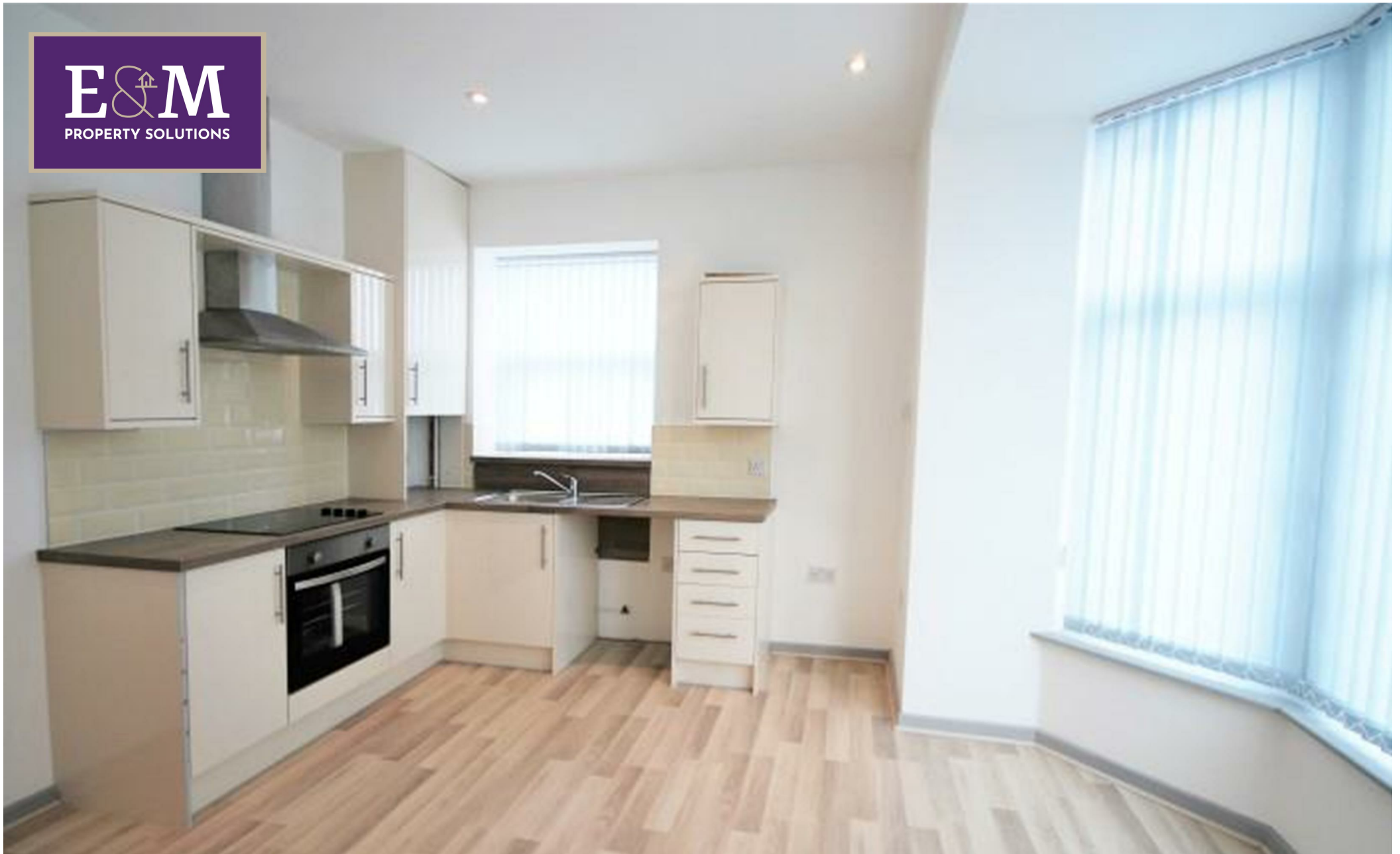
Apartment 3, Luna Apartments 23-25 Spenser Street, Padiham, Lancashire, BB12 8RD £550 Per month