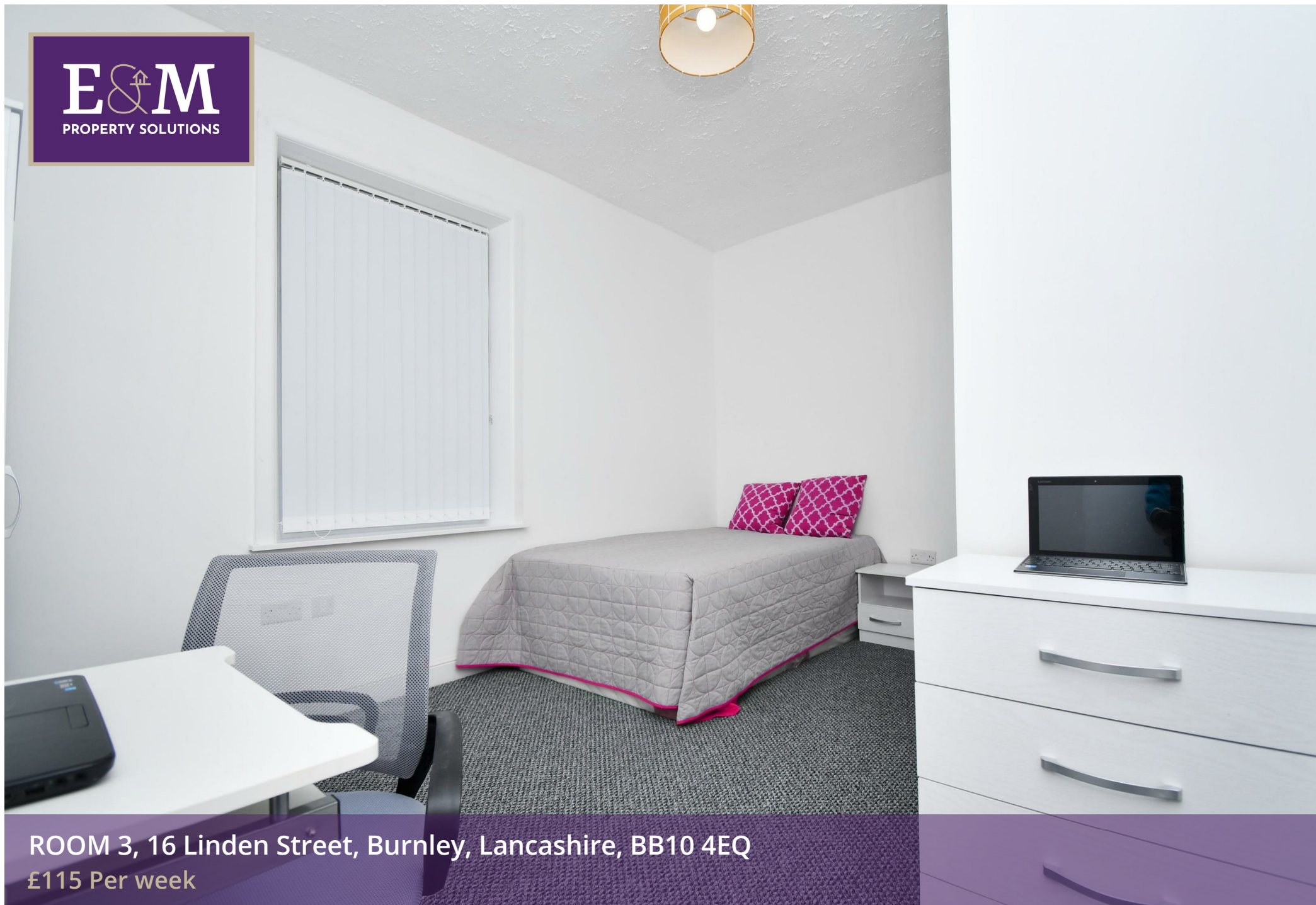
ROOM 3, 16 Linden Street, Burnley, Lancashire, BB10 4EQ £115 Per week