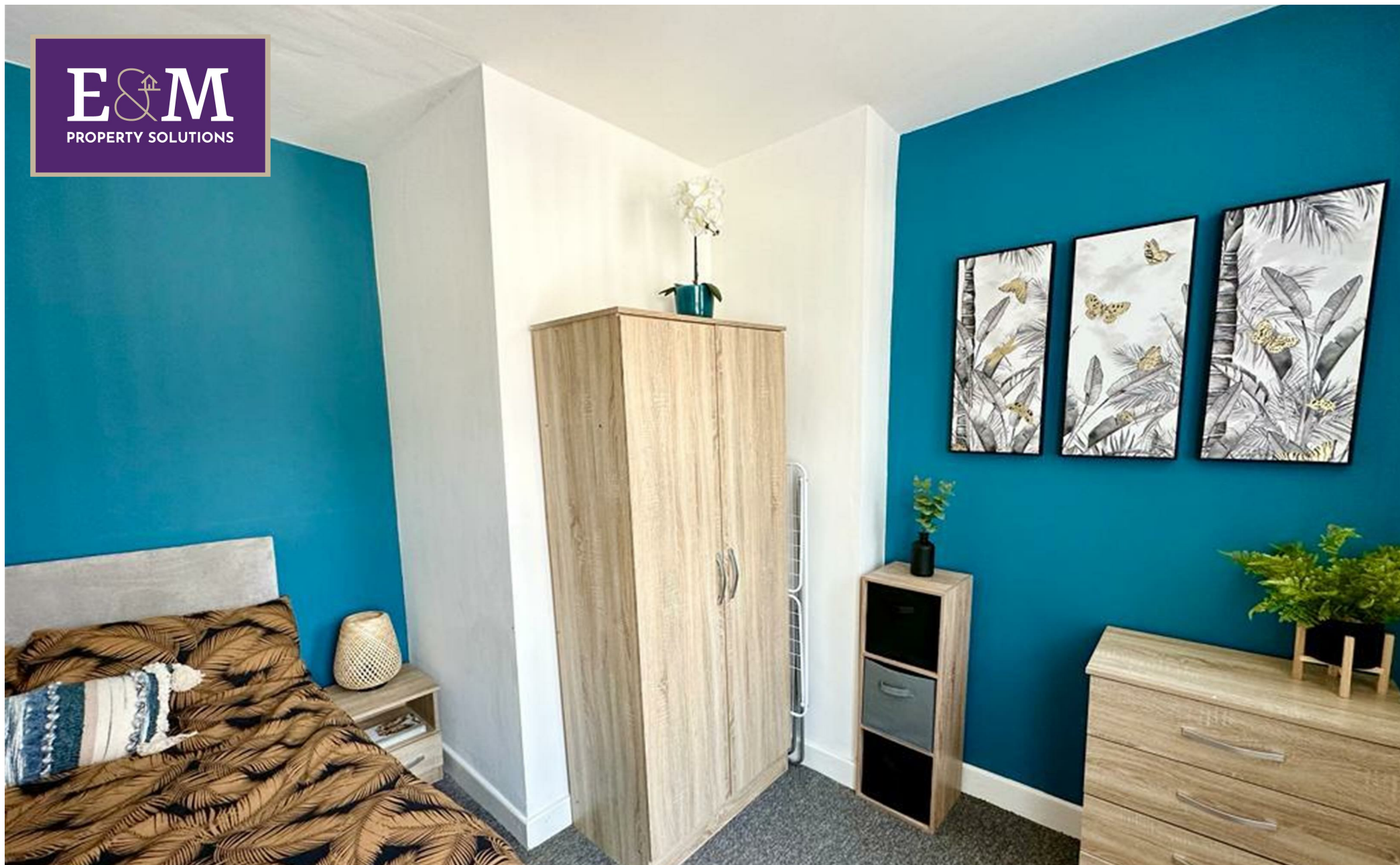
ROOM 2, 7 Woodbine Road, Burnley, Lancashire, BB12 6RE £90 Per week