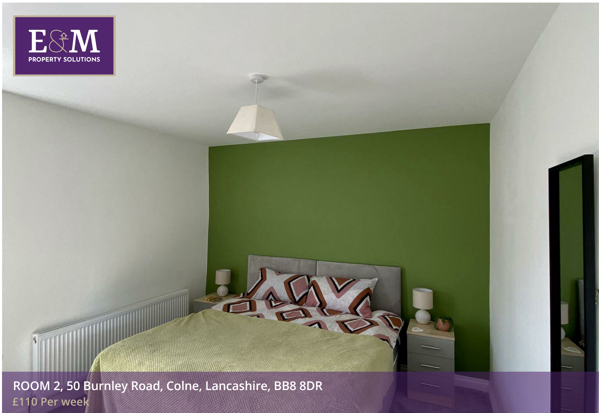
ROOM 2, 50 Burnley Road, Colne, Lancashire, BB8 8DR £110 Per week