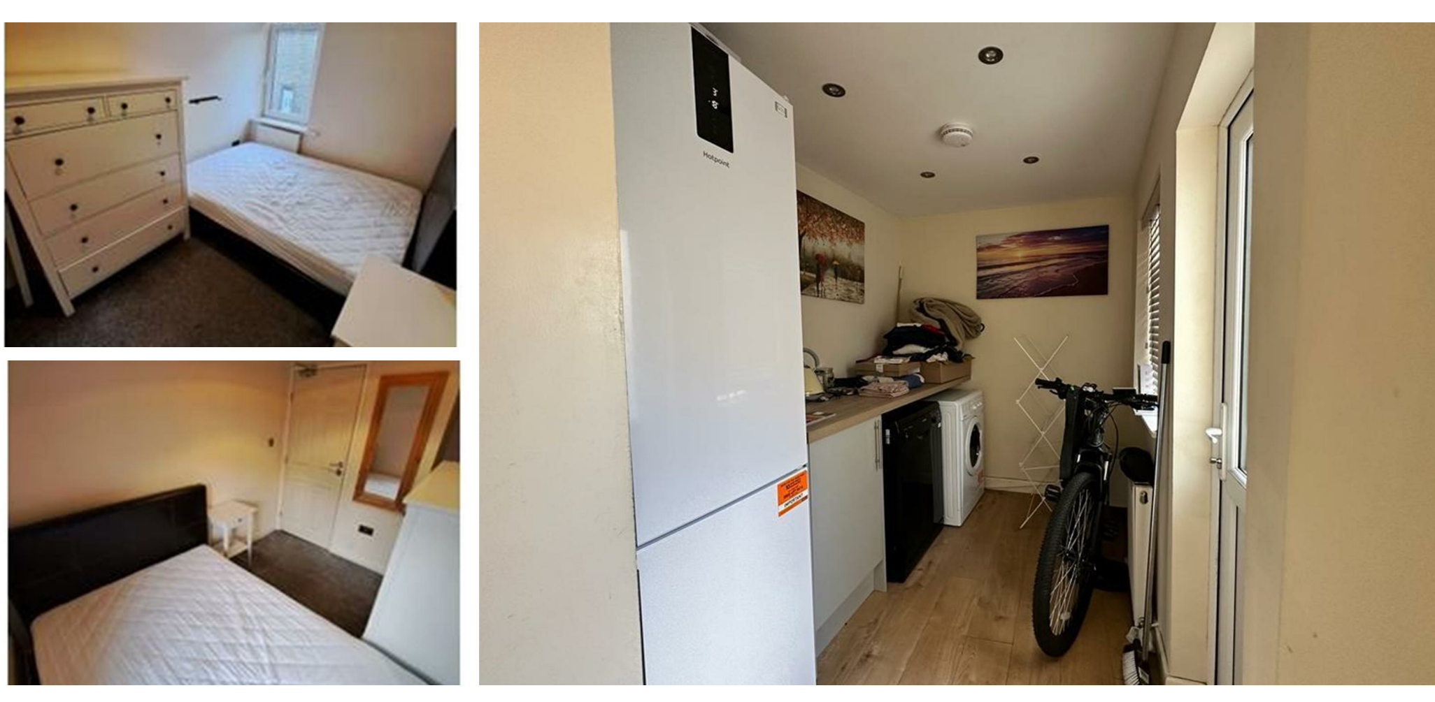
ROOM 2, 8 Hinton Street, Burnley, Lancashire, BB10 4EB