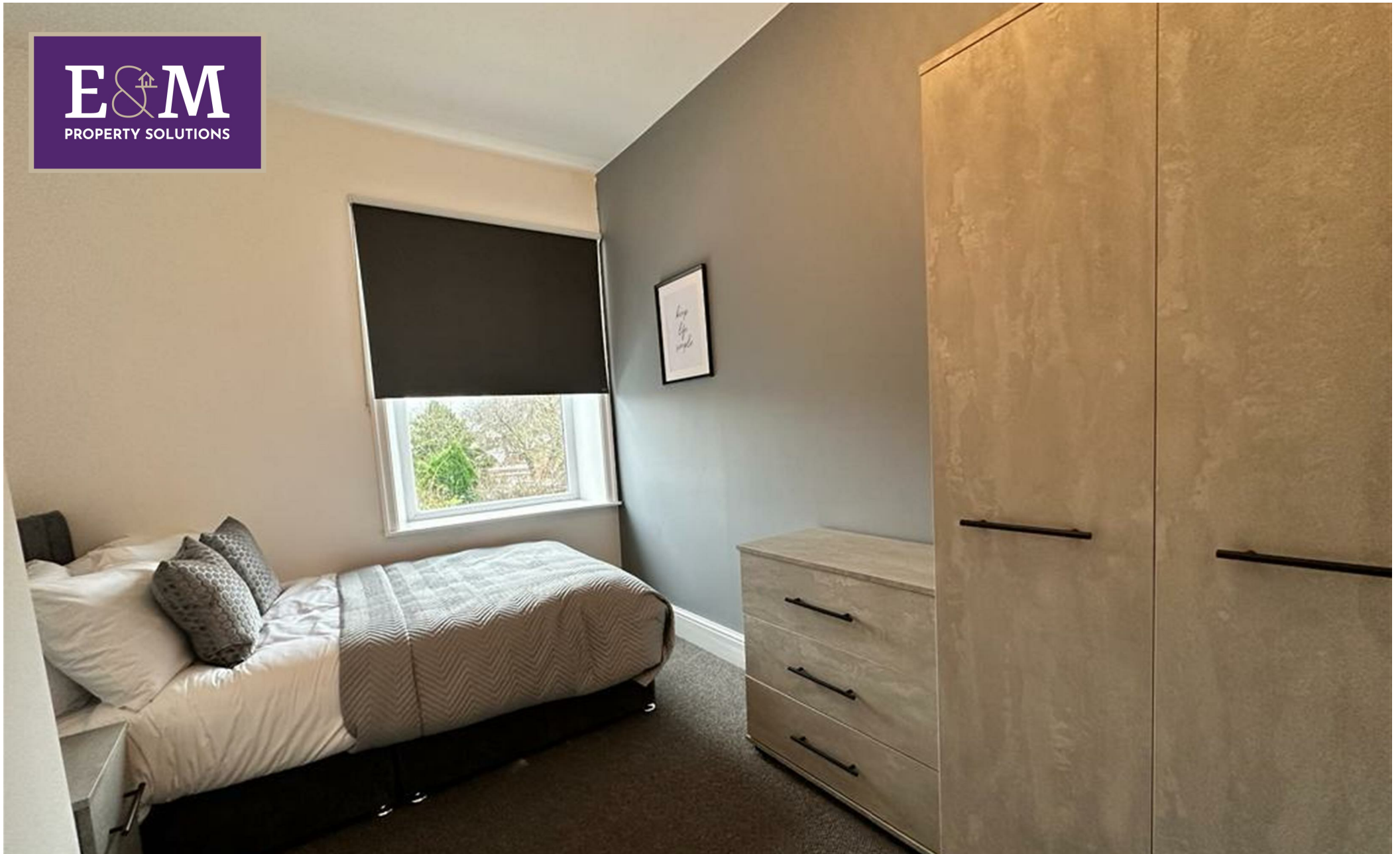
ROOM 4, 2-4 Collinge Street, Padiham, Burnley, Lancashire, BB12 7BA £95 Per week