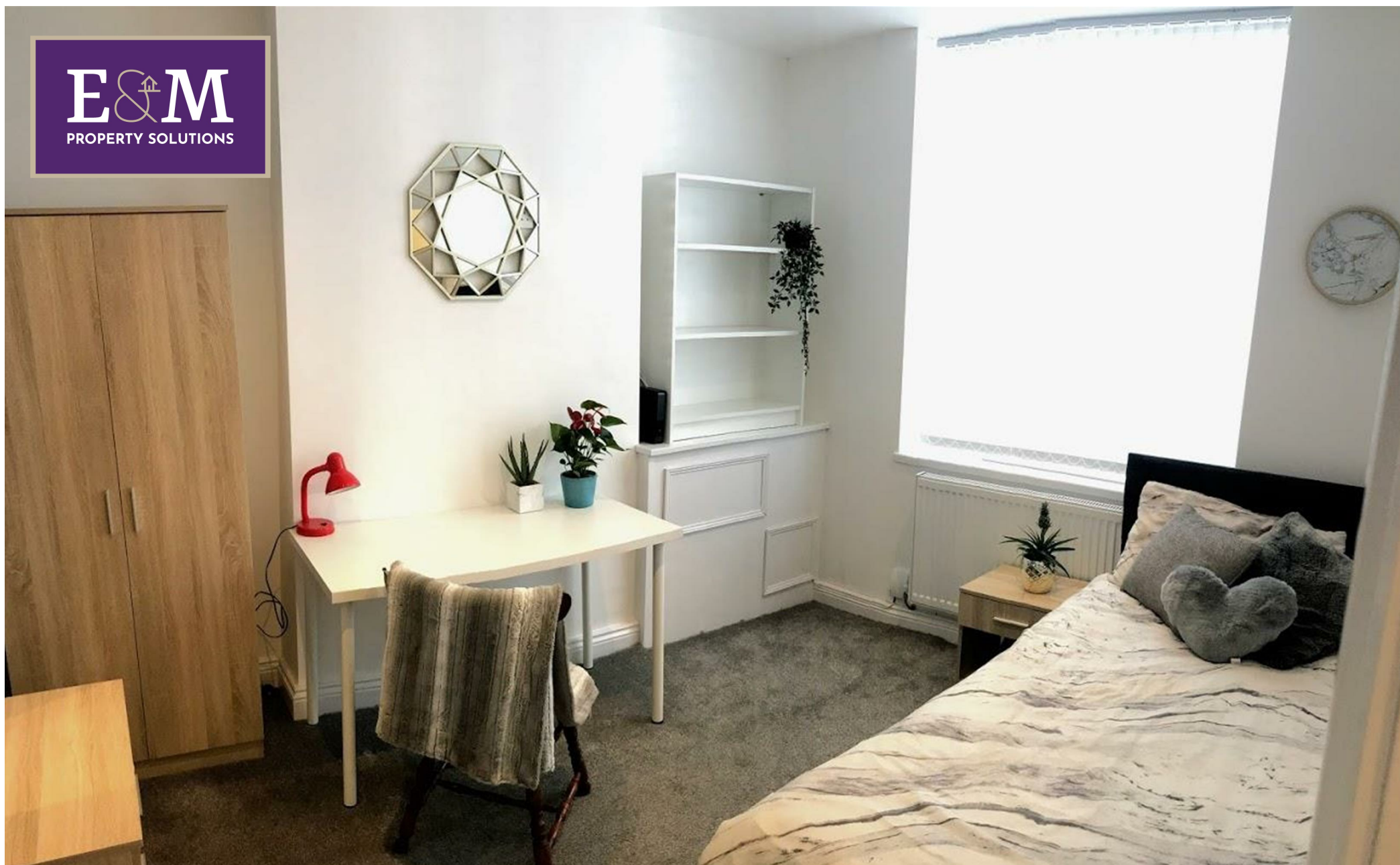
Room 1, 48 Heath Street, Burnley, Lancashire, BB10 3BL £90 Per week