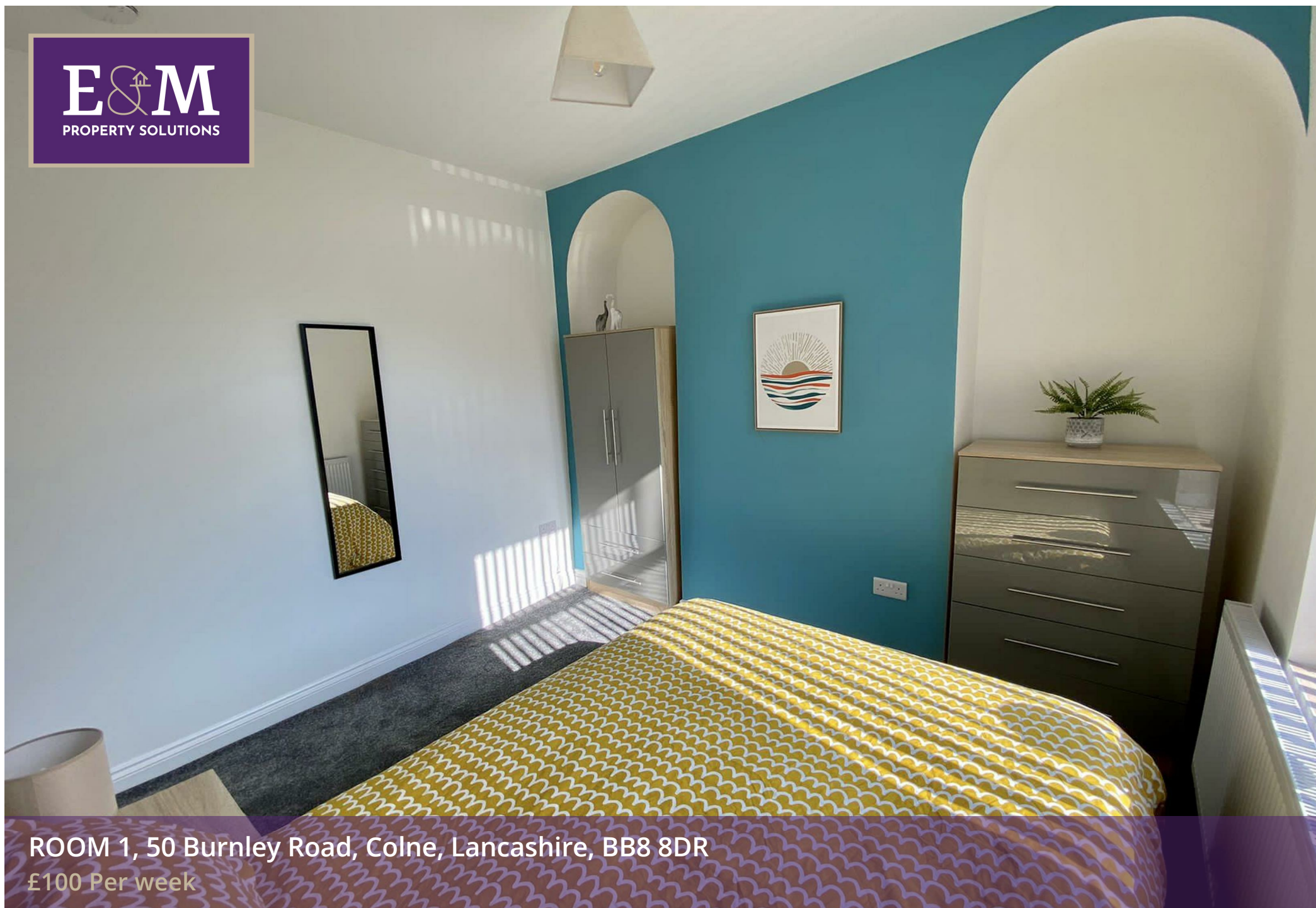
ROOM 1, 50 Burnley Road, Colne, Lancashire, BB8 8DR £100 Per week