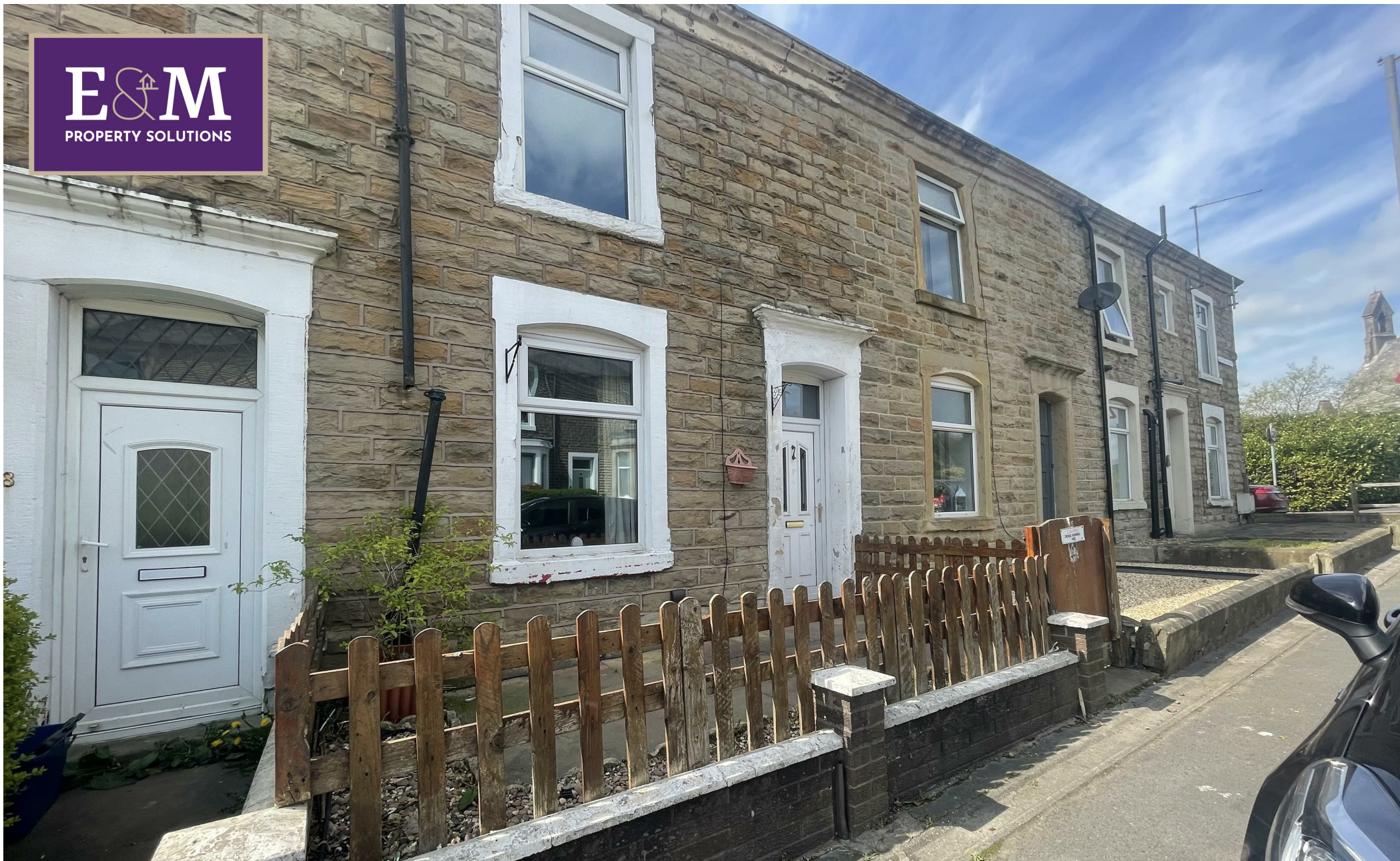
6 Hapton Road, Padiham, BB12 7AJ £65,000