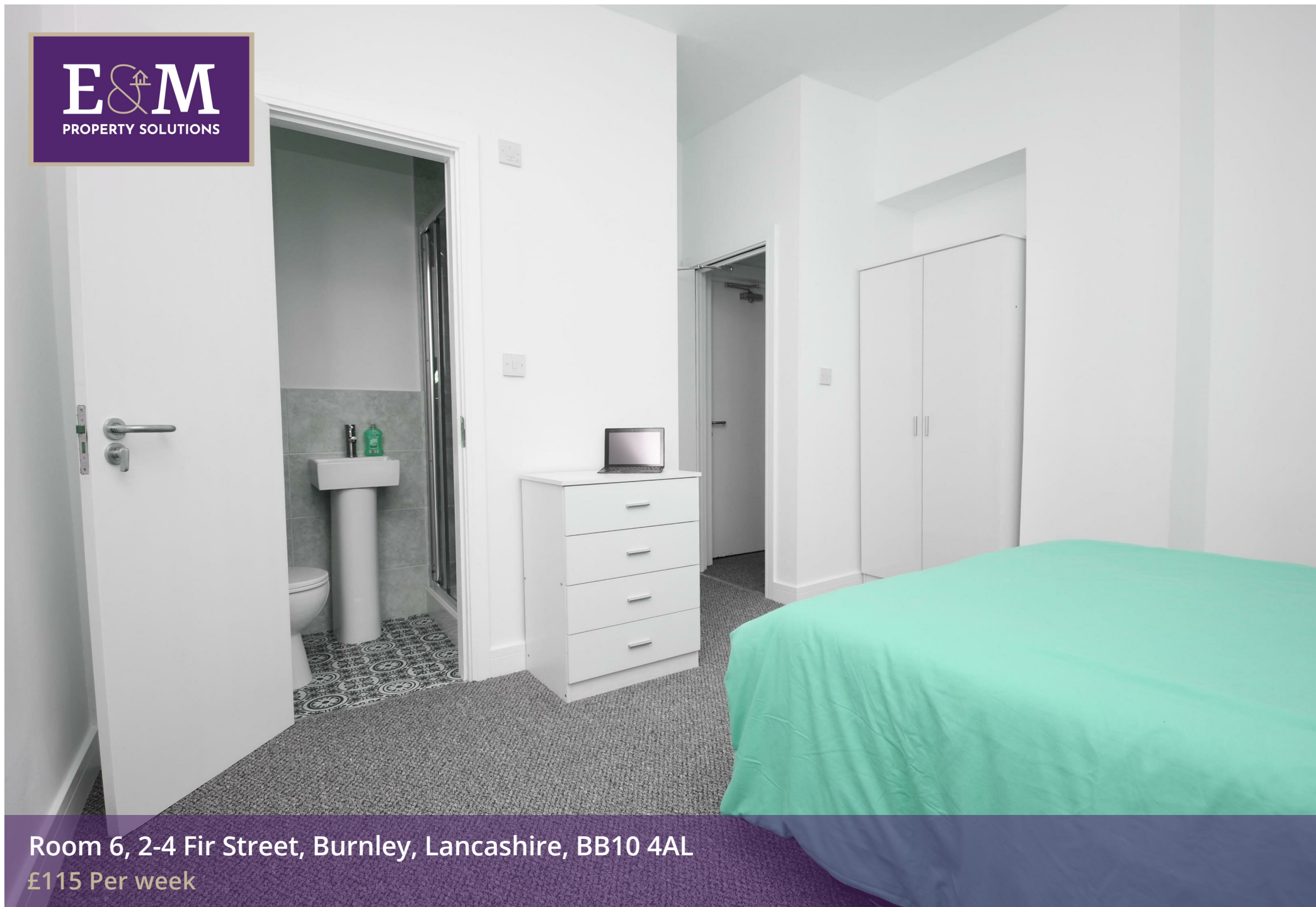
Room 6, 2-4 Fir Street, Burnley, Lancashire, BB10 4AL £115 Per week