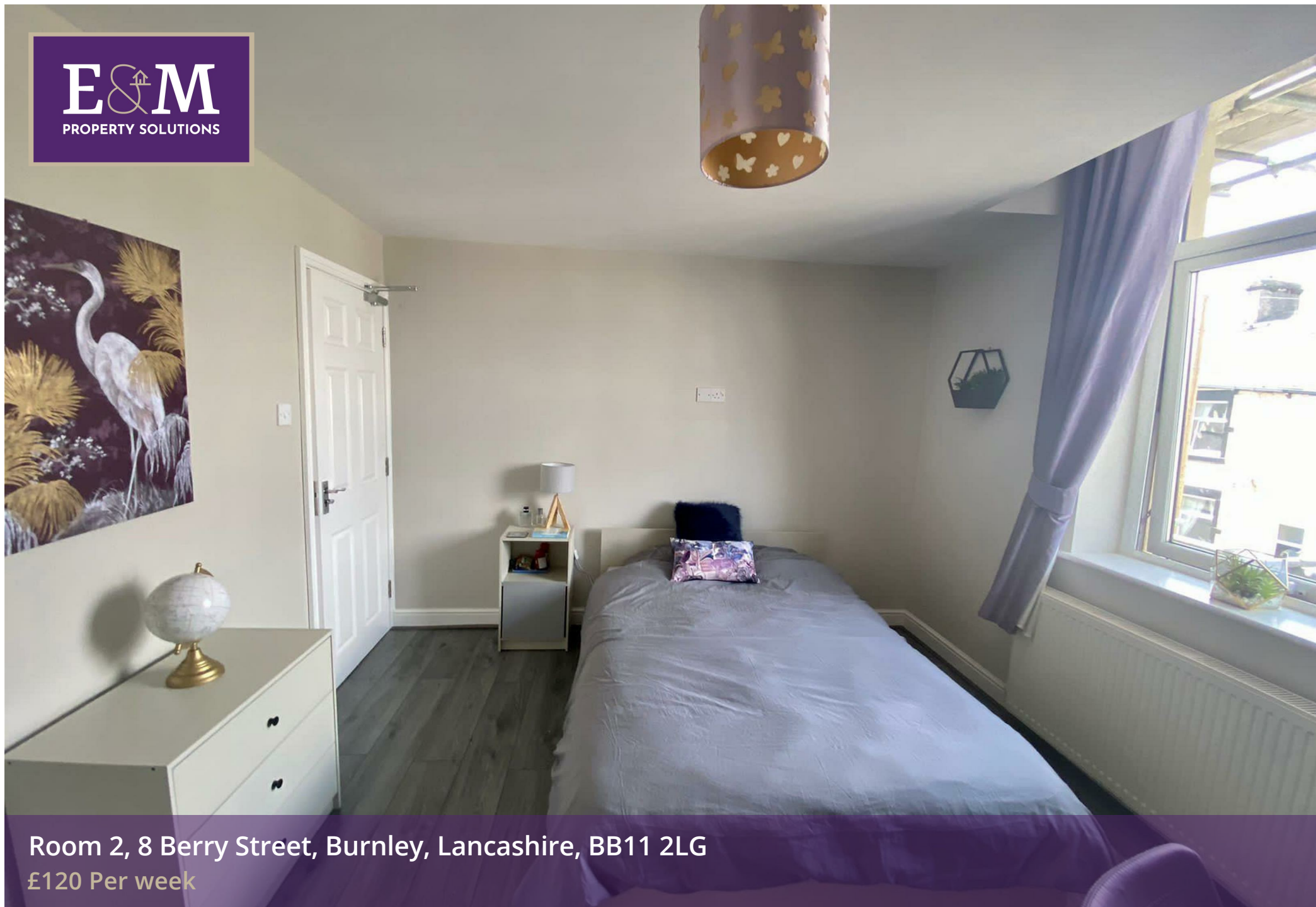
Room 2, 8 Berry Street, Burnley, Lancashire, BB11 2LG £120 Per week