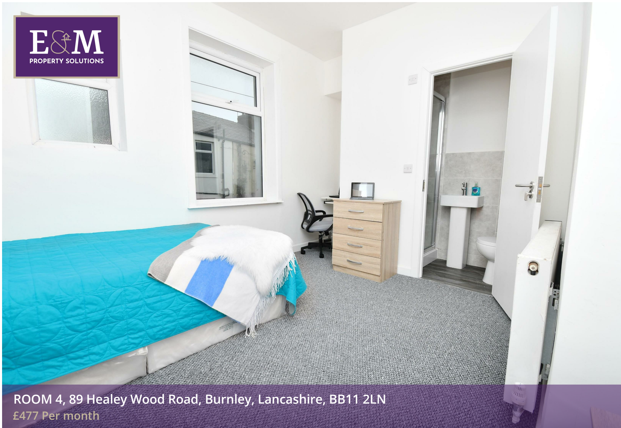
ROOM 4, 89 Healey Wood Road, Burnley, Lancashire, BB11 2LN £477 Per month