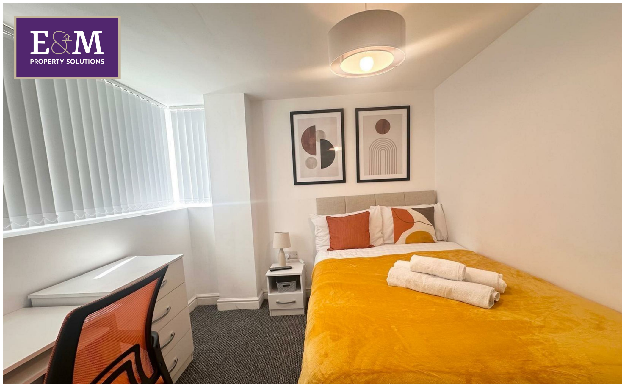
Room 2, 33 Lebanon Street, Burnley, Lancashire, BB10 4DF £89 Per week