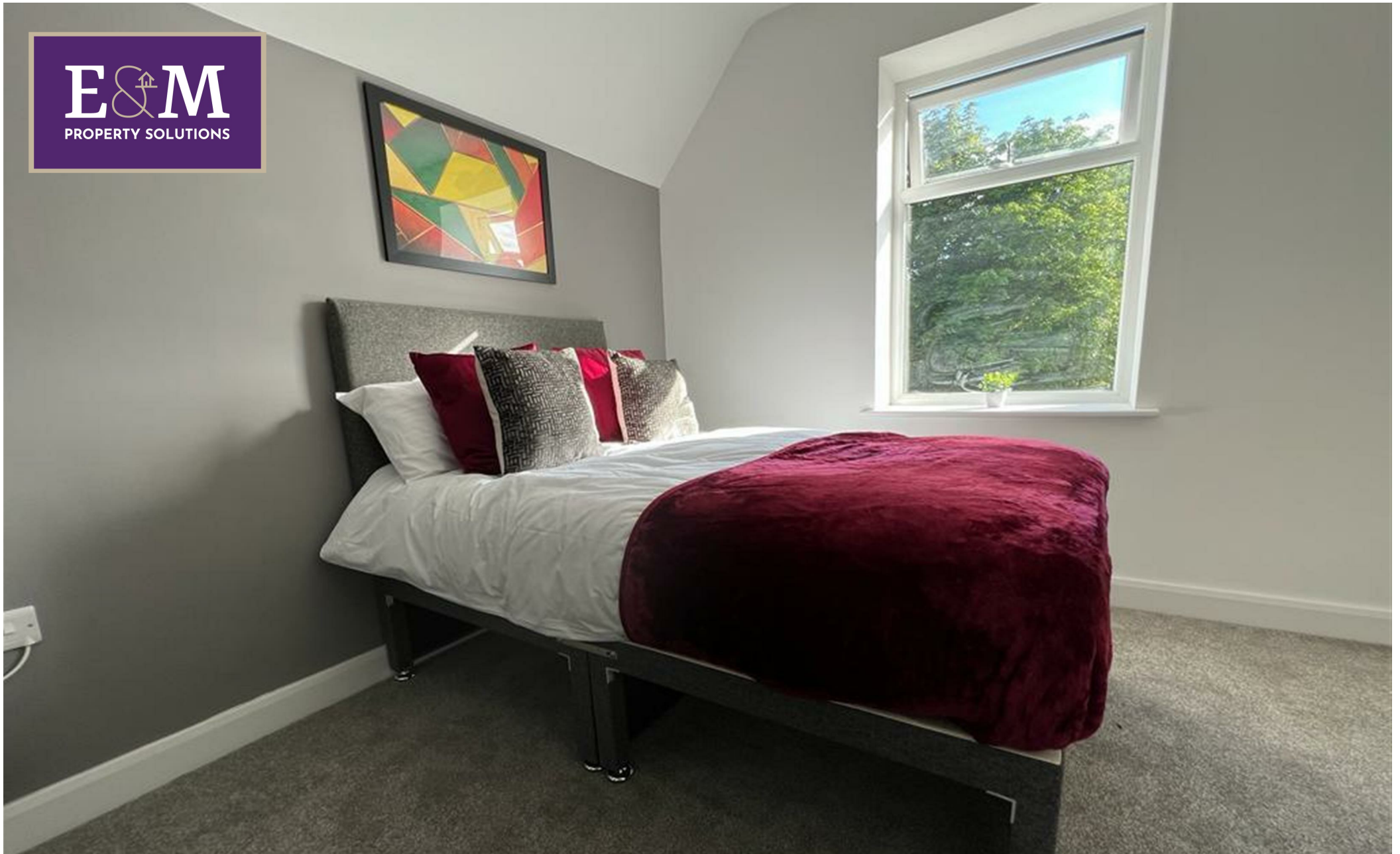
Room 7, 79-81 Church Street, Burnley, Lancashire, BB11 2RS £100 Per week