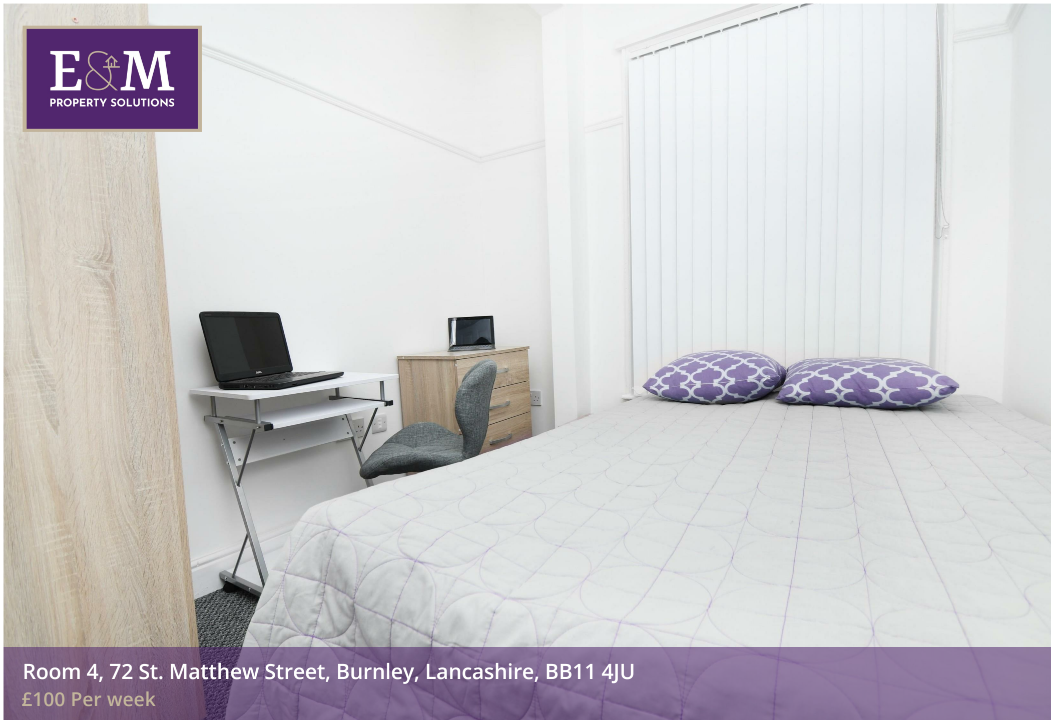
Room 4, 72 St. Matthew Street, Burnley, Lancashire, BB11 4JU £100 Per week