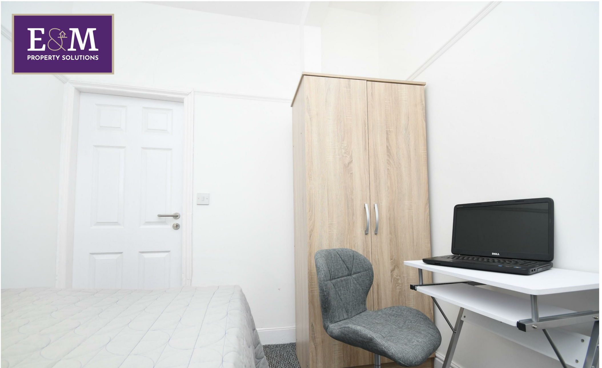
ROOM 4, 11 St. Ignatius Square, Preston, Lancashire, PR1 1TT £110 Per week