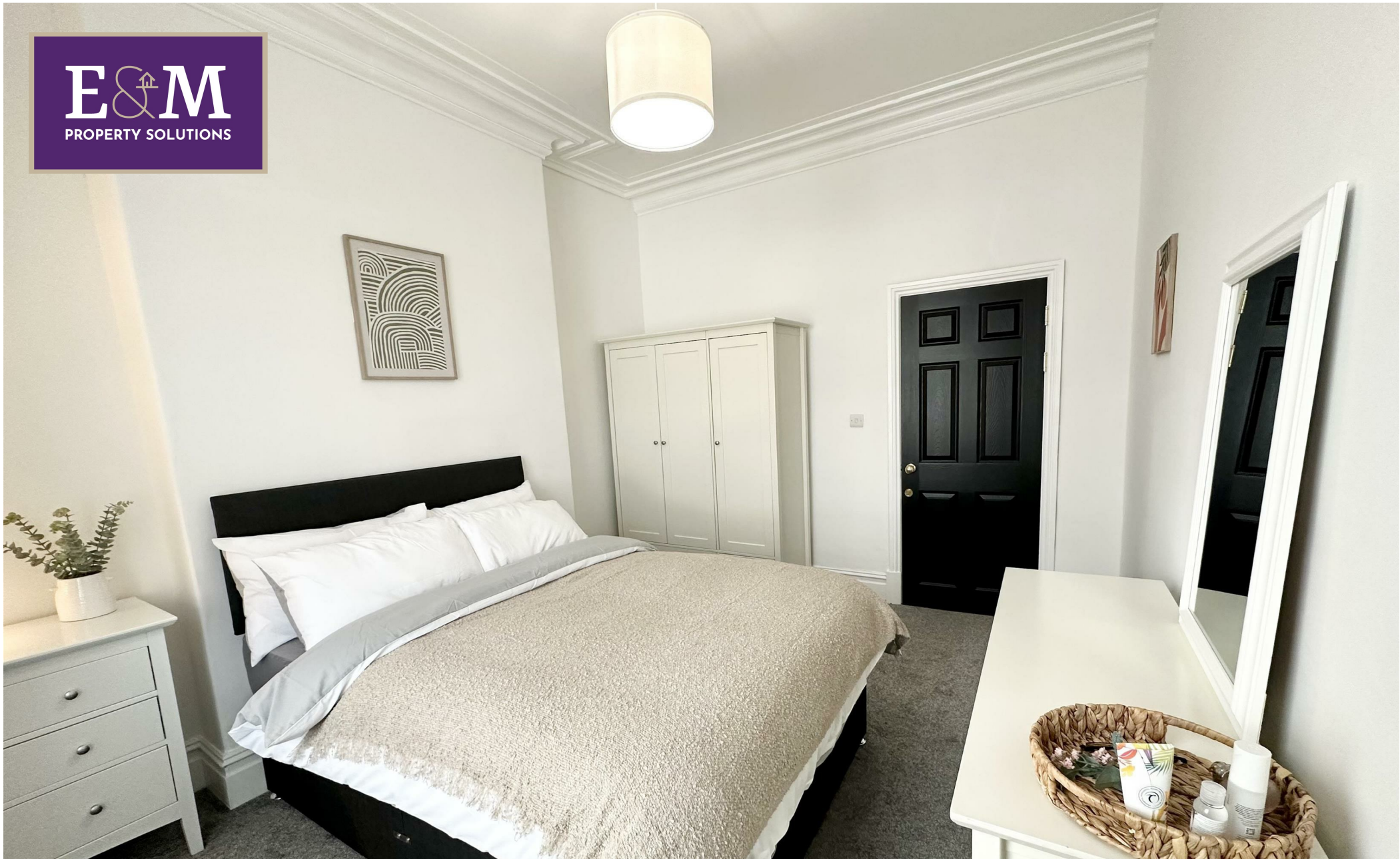
ROOM 3, 54 Bank Parade, Burnley, Lancashire, BB11 1TS £150 Per week