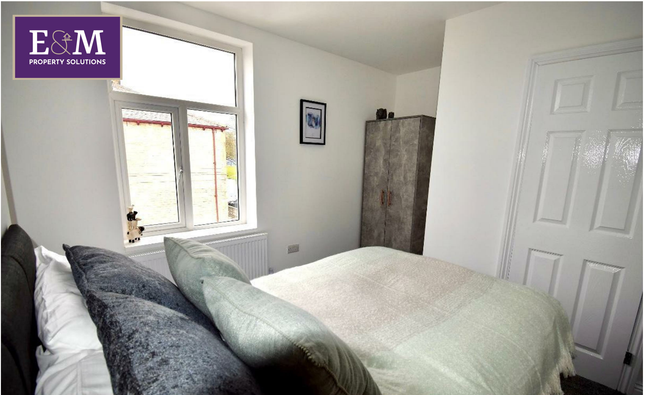
ROOM 3, 4 Brockenhurst Street, Burnley, Lancashire, BB10 4ET £477 Per month