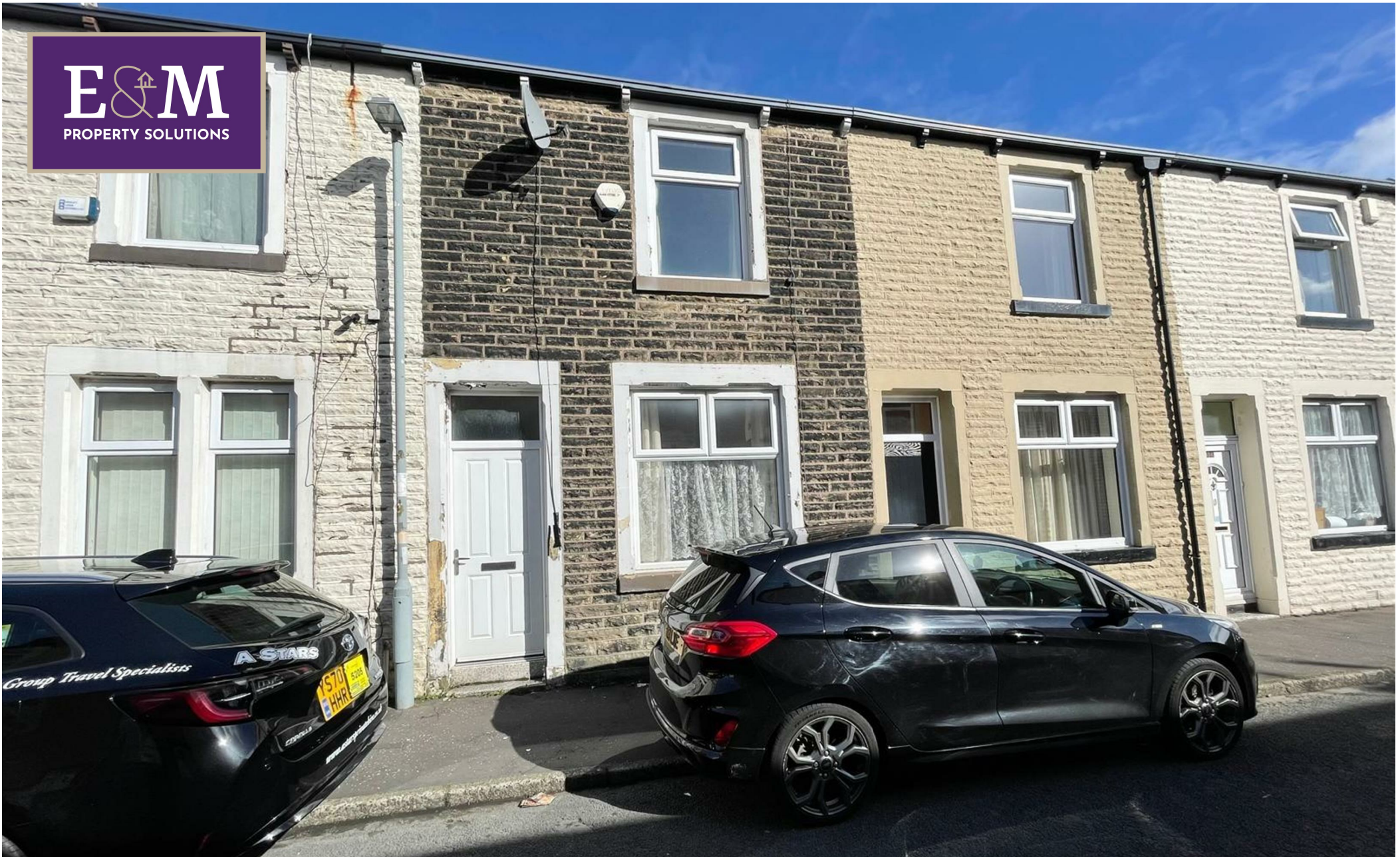
40 Scarlett Street, Burnley, BB11 4LQ Offers in the region of £64,995