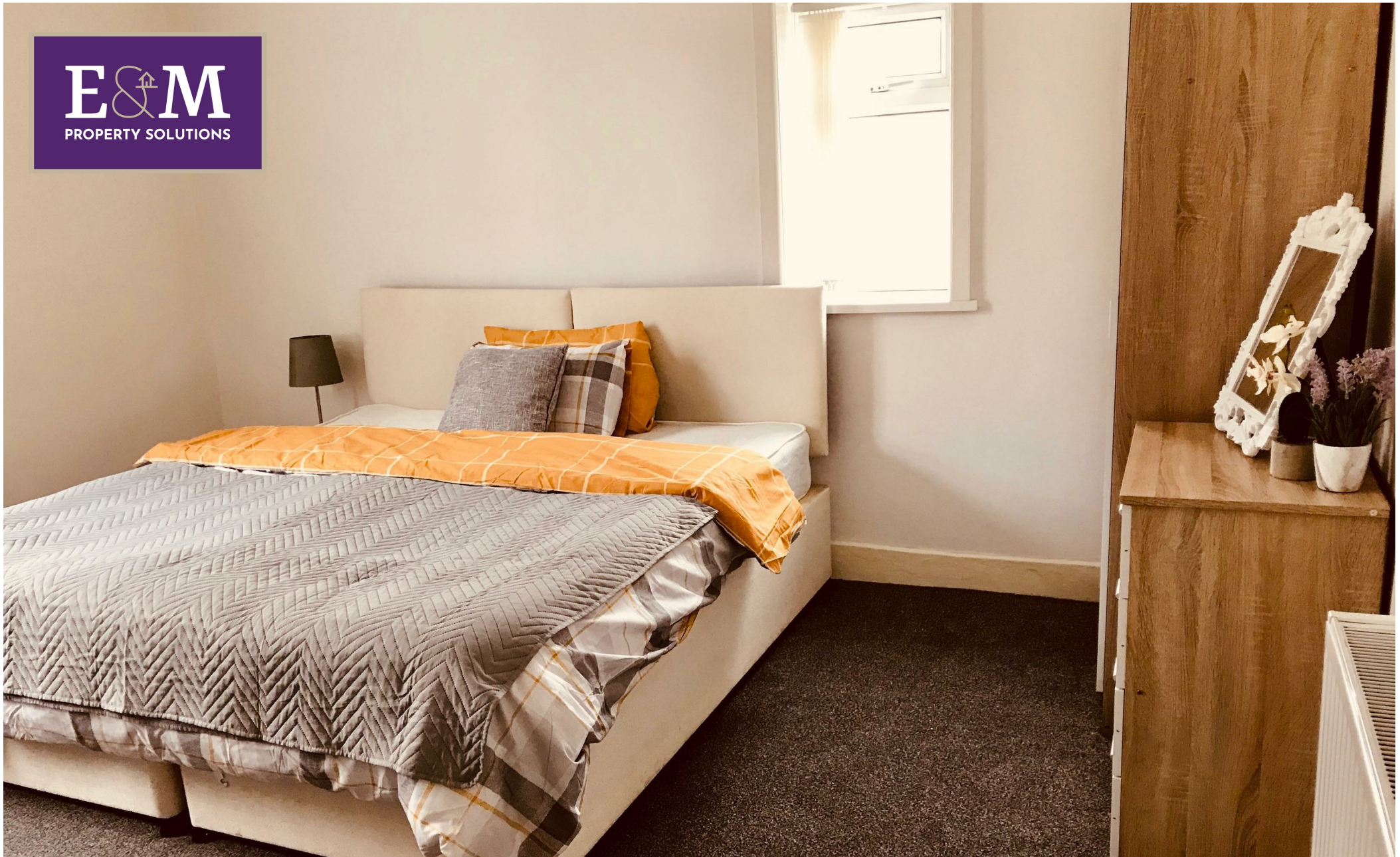
Room 1, 31 Queensberry Road, Burnley, Lancashire, BB11 4LH £90 Per week