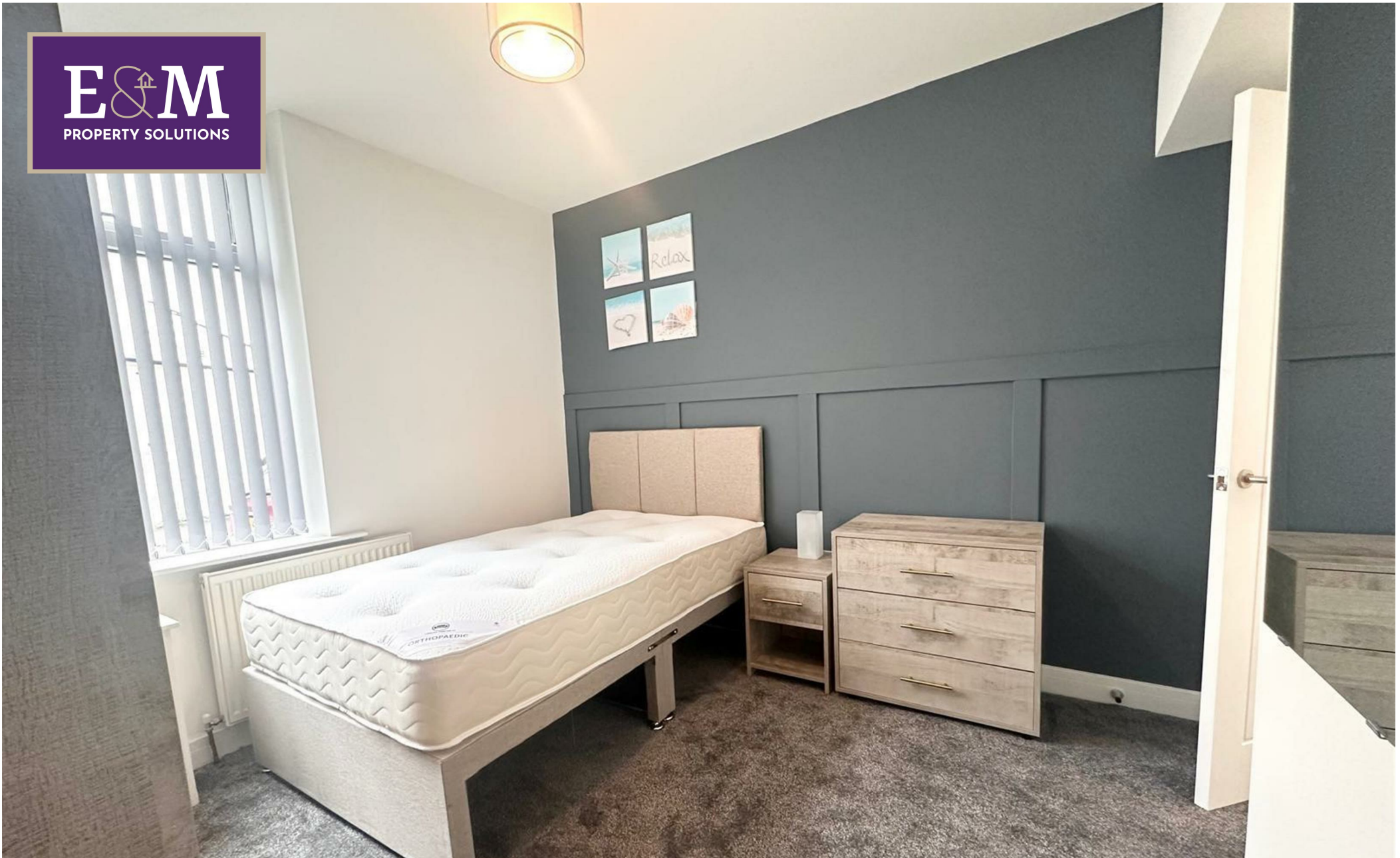
Room 3, 12 Bulcock Street, Burnley, BB10 1UB £520 Per month