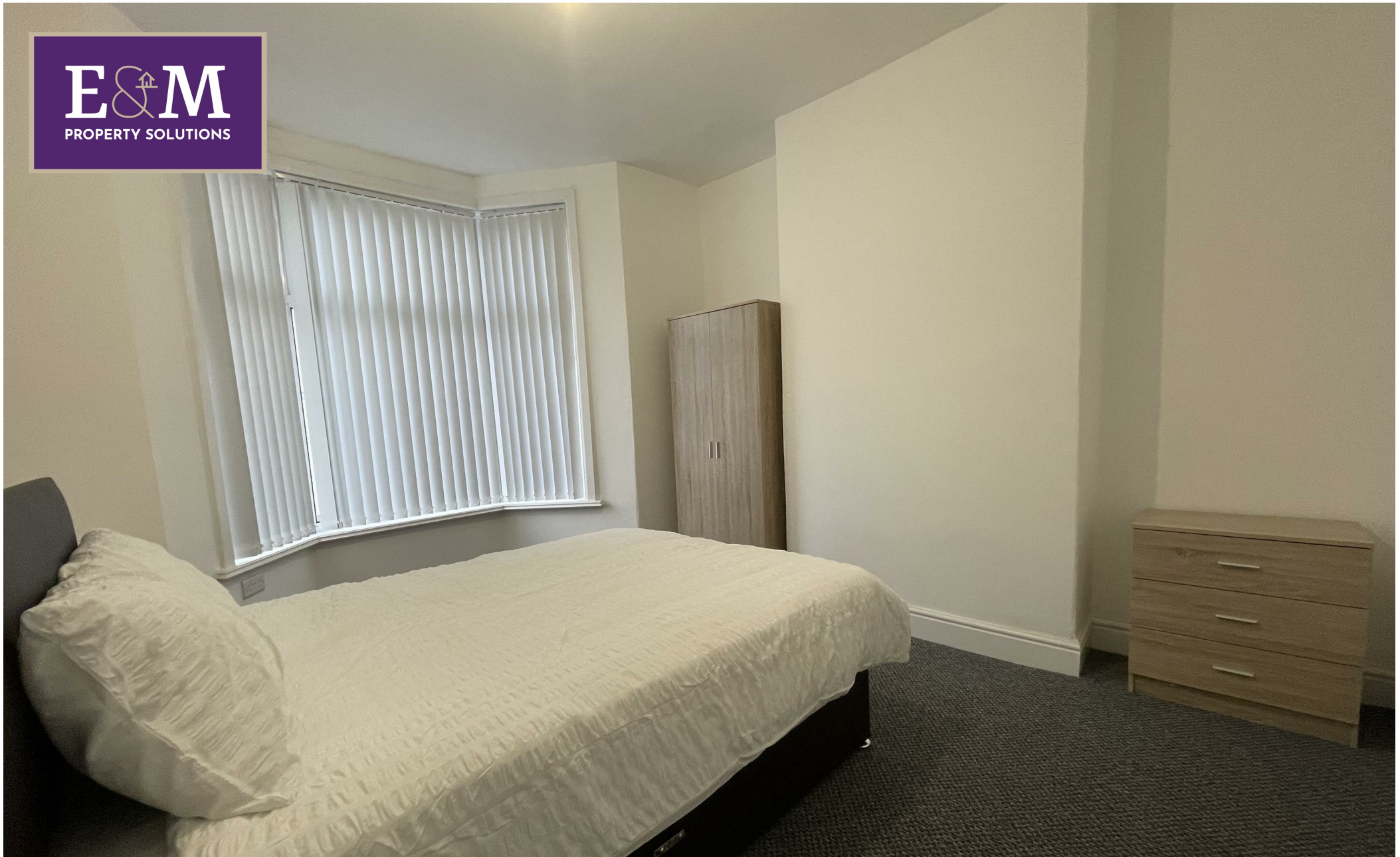
Room 1, 71 Lyndhurst Road, Burnley, Lancashire, BB10 4DH £100 Per week