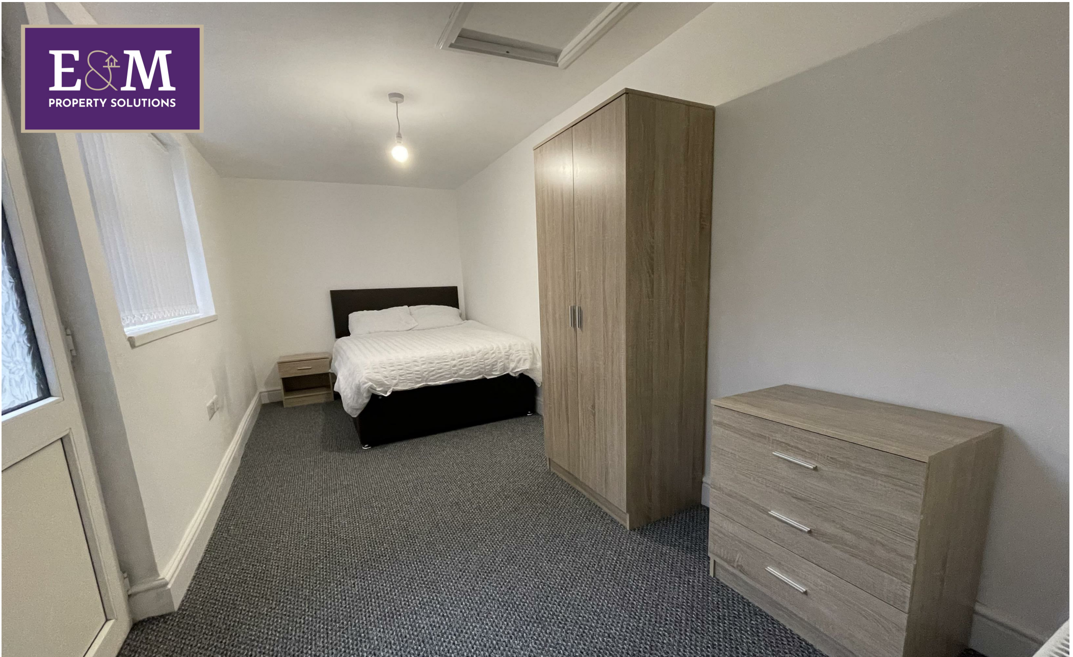
ROOM 2, 71 Lyndhurst Road, Burnley, Lancashire, BB10 4DH £95 Per week