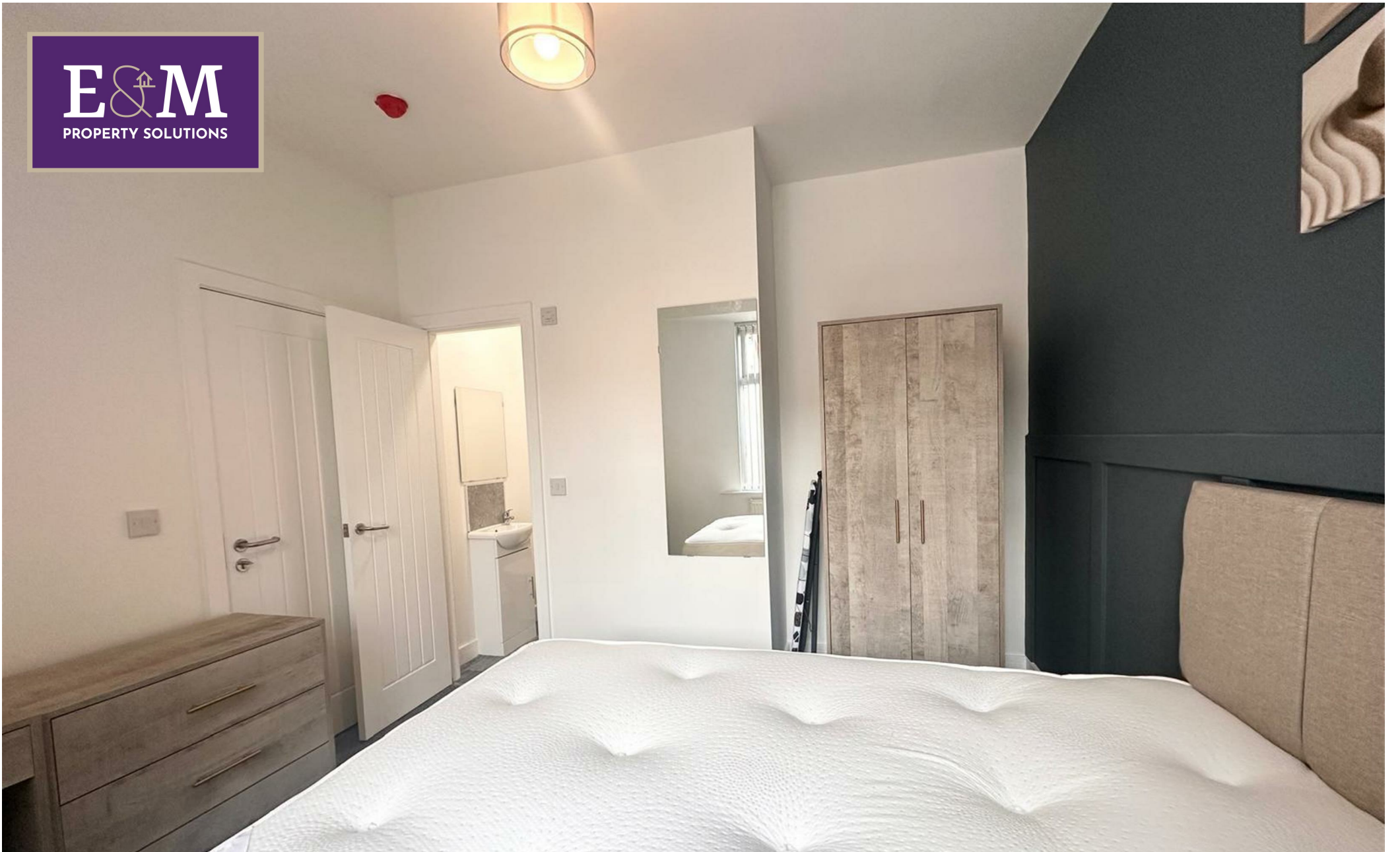
ROOM 4, 12 Bulcock Street, Burnley, BB10 1UB £520 Per month