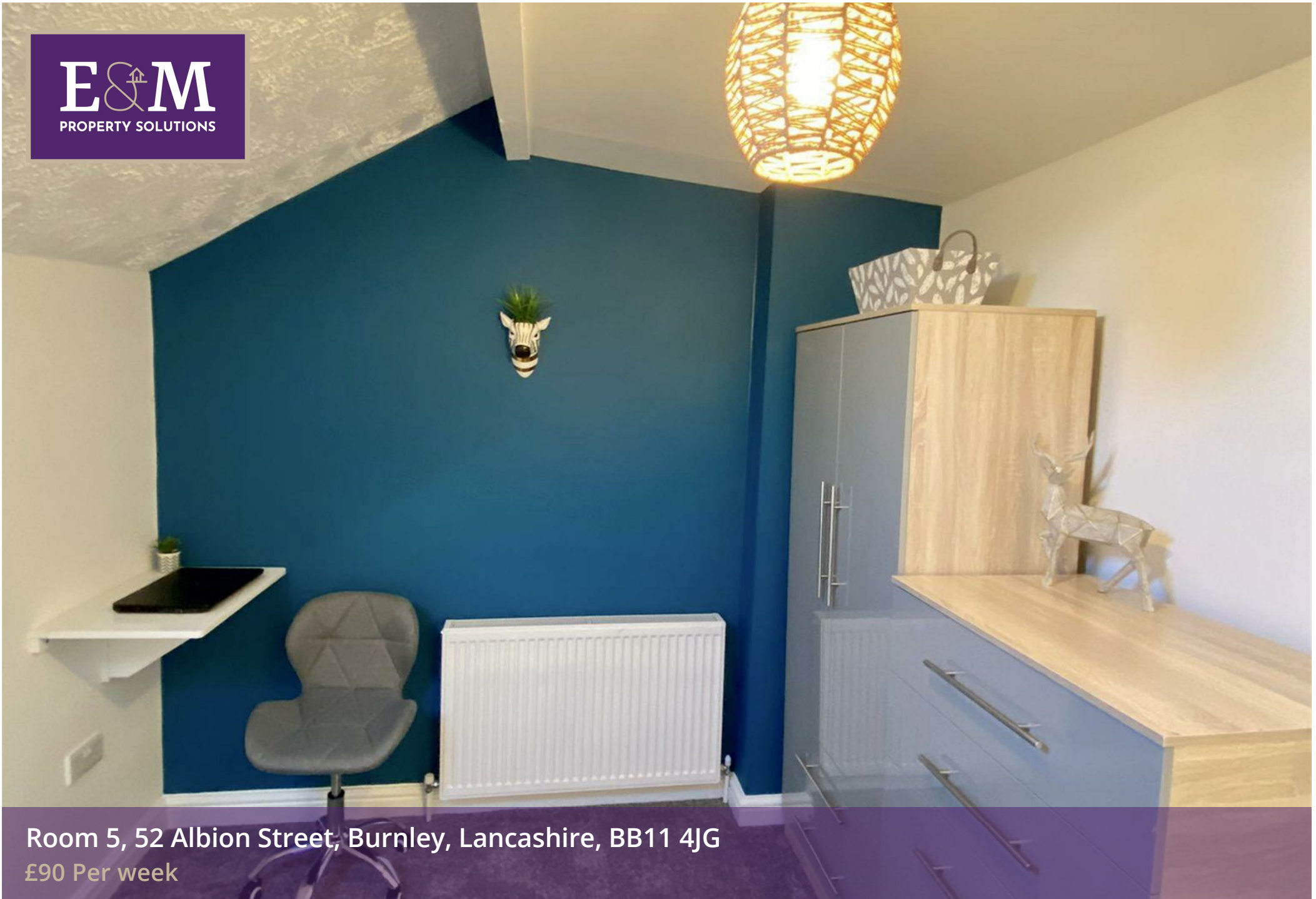
Room 5, 52 Albion Street, Burnley, Lancashire, BB11 4JG £90 Per week