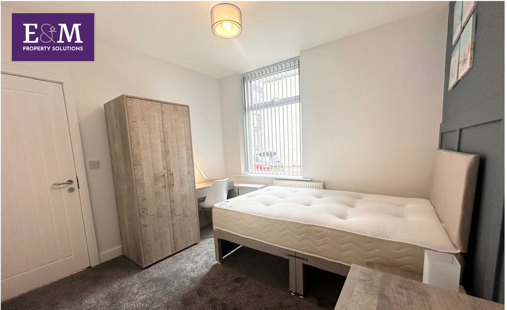
Room 1, 12 Bulcock Street, Burnley, BB10 1UB £120 Per week