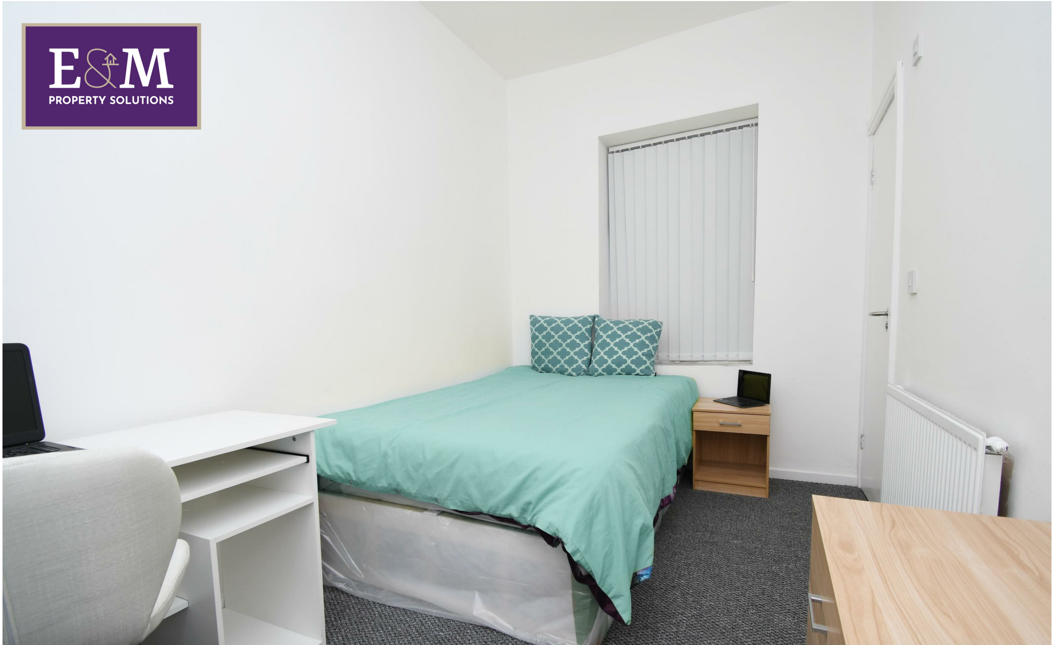
Room 1, 27 Nairne Street, Burnley, Lancashire, BB11 4BT £100 Per week