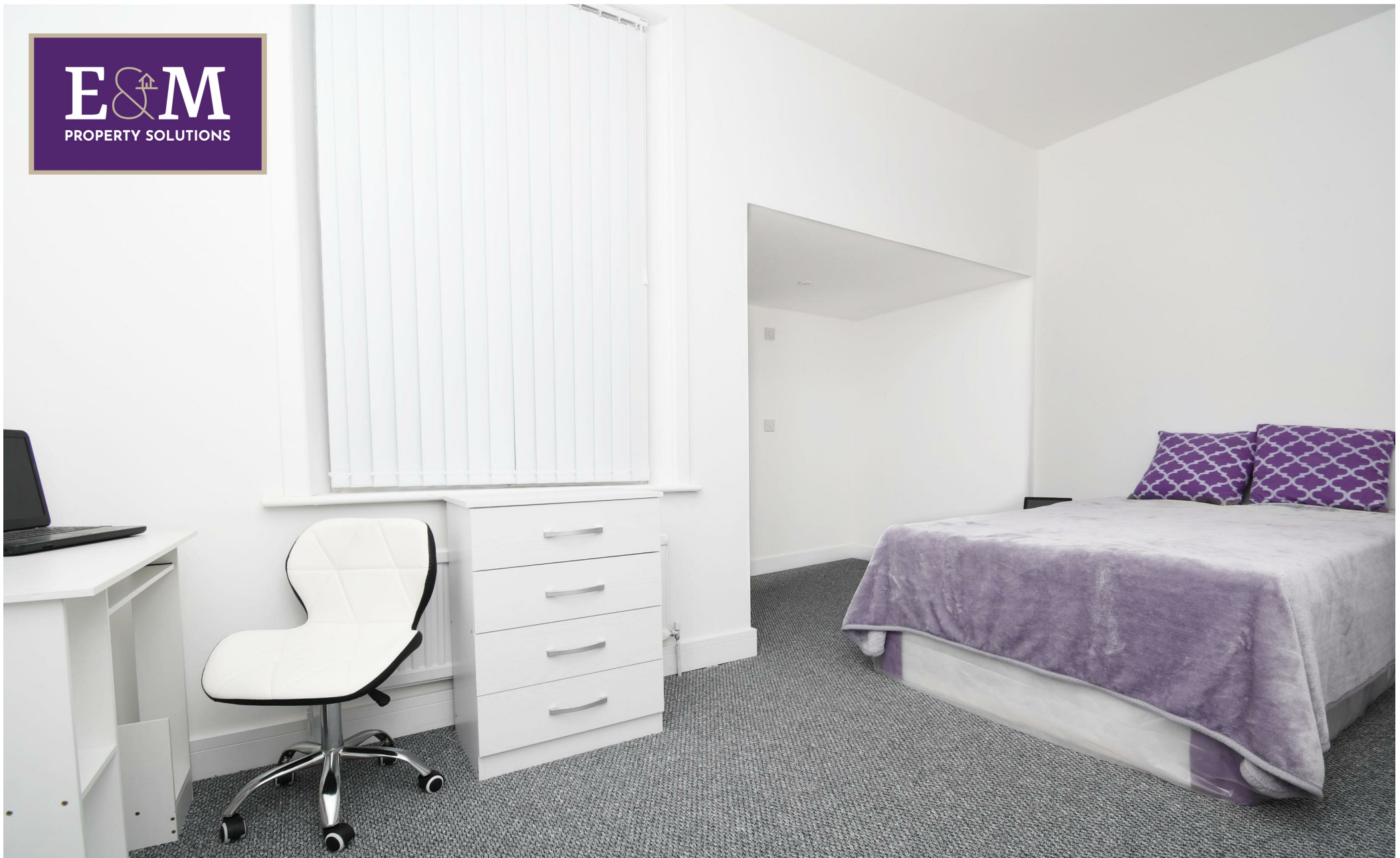
Room 2, 10 Berry Street, Burnley, Lancashire, BB11 2LG £95 Per week