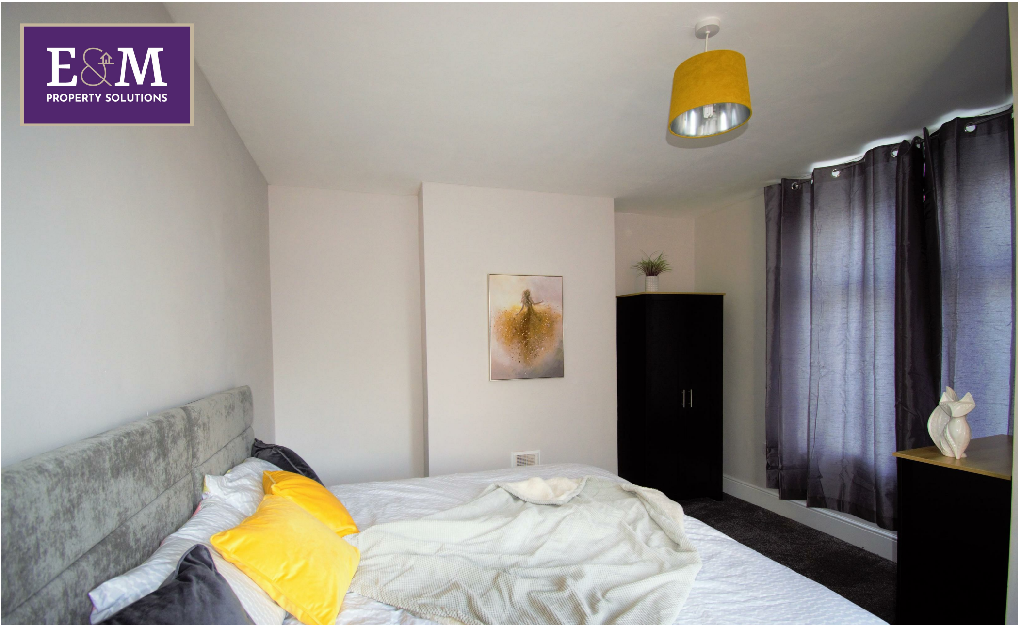
Room 1, 1 Bulcock Street, Burnley, Lancashire, BB10 1UH £110 Per week