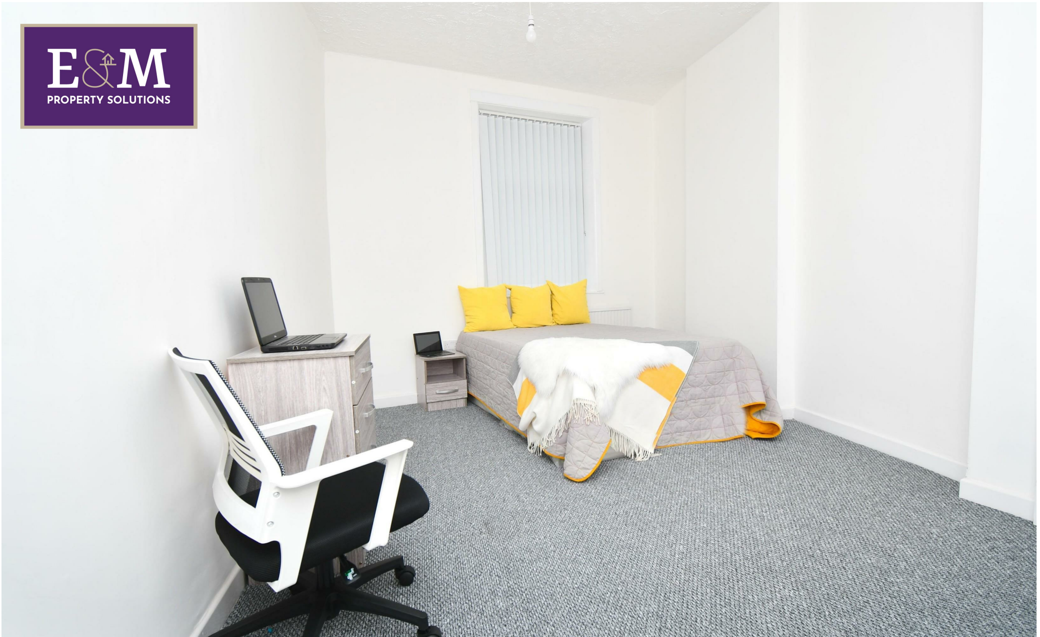
Room 3, 4 Ribblesdale Street, Burnley, Lancashire, BB10 3AZ £105 Per week