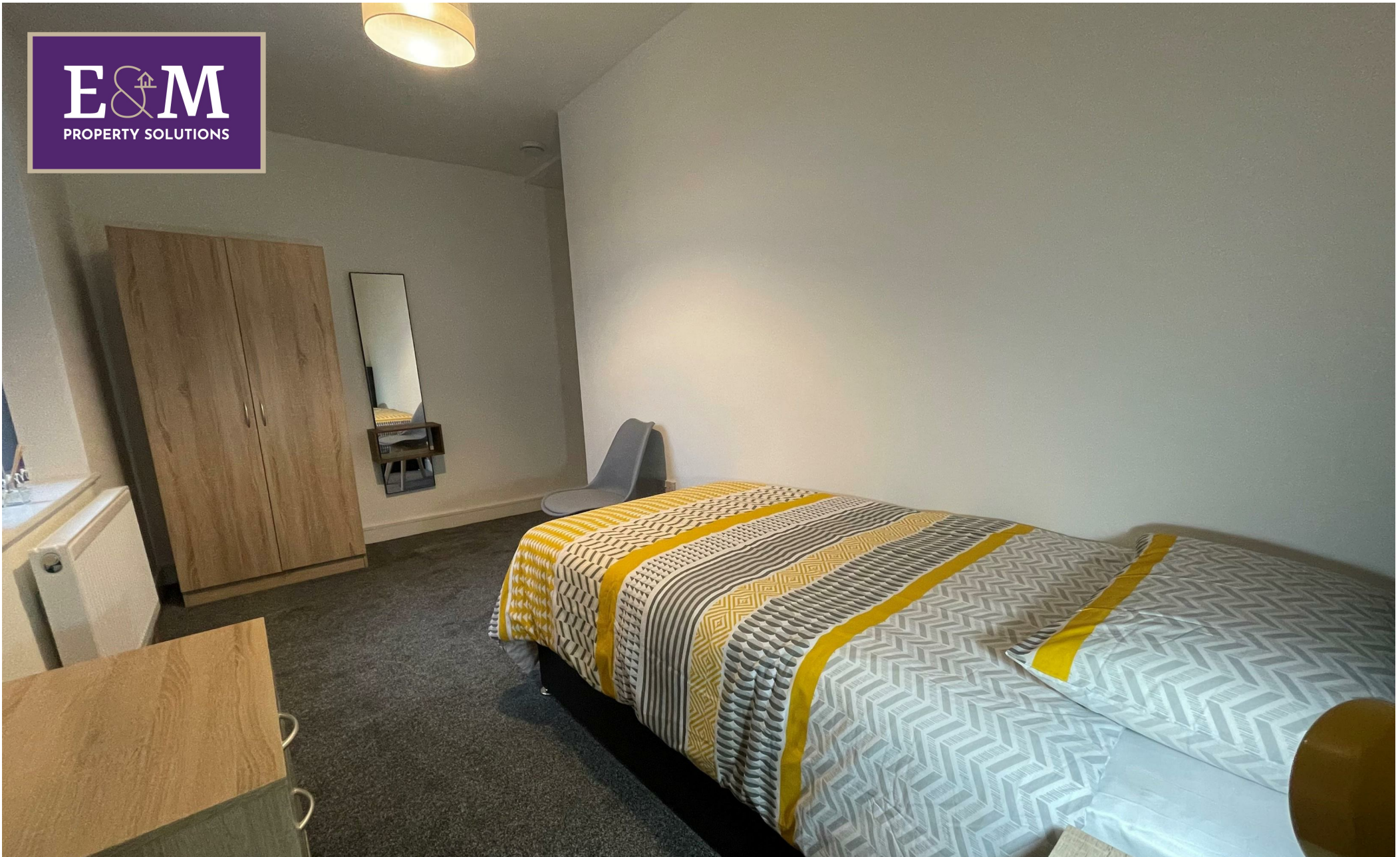
ROOM 4, 1 Renshaw Street, Burnley, Lancashire, BB10 1SX £95 Per week