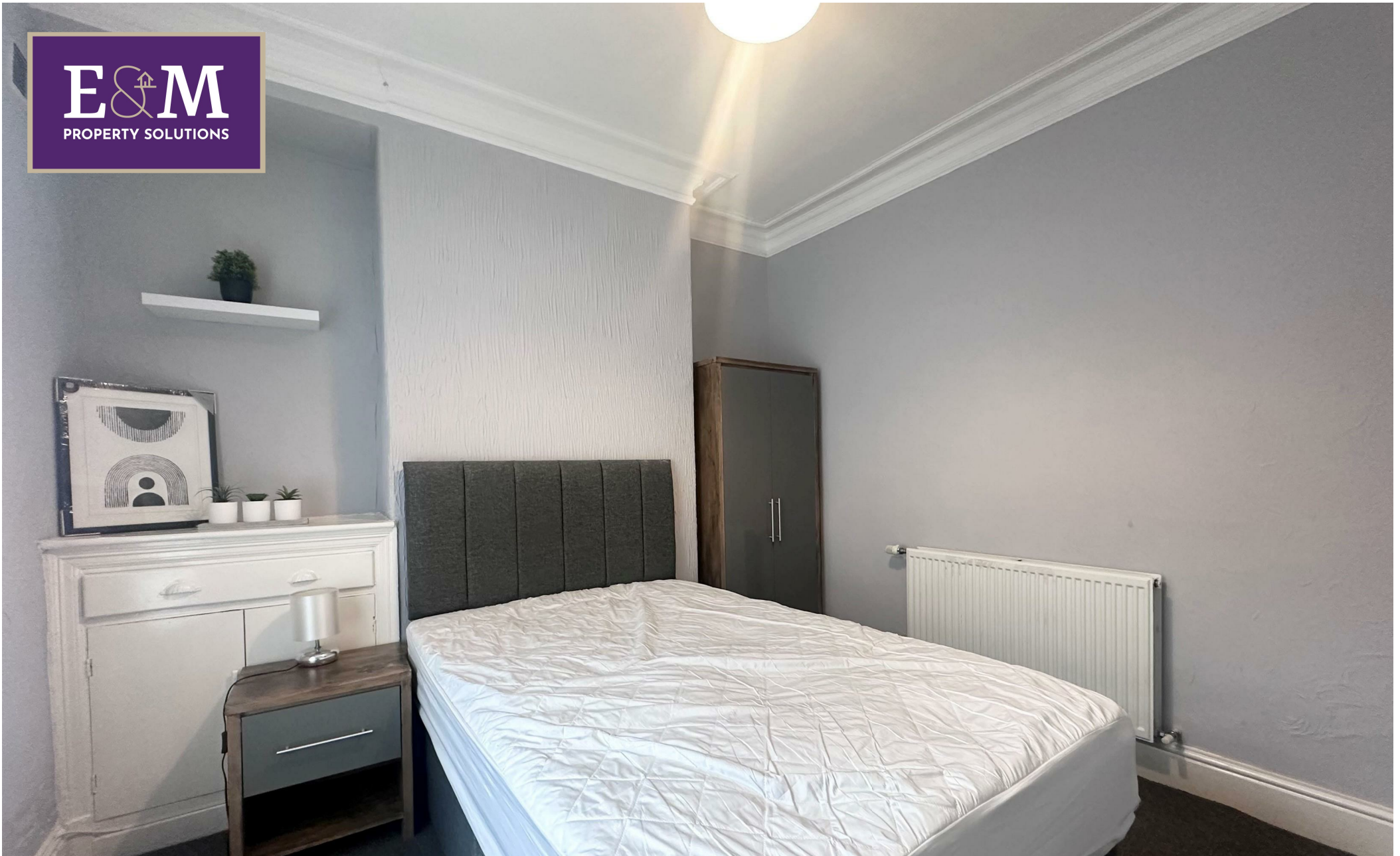
Room 1, 108 Nairne Street, Burnley, Lancashire, BB11 4PD £90 Per week