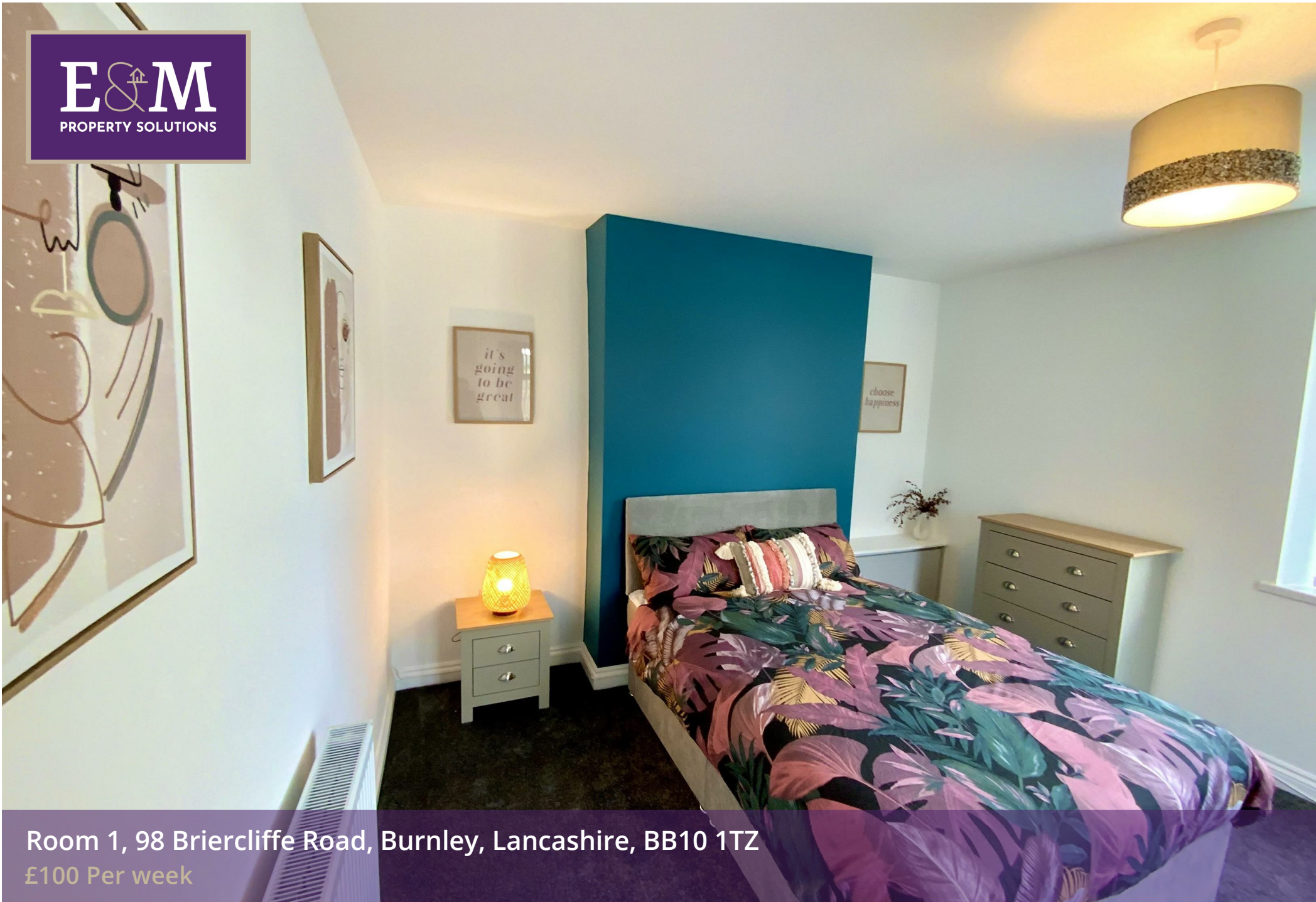
Room 1, 98 Briercliffe Road, Burnley, Lancashire, BB10 1TZ £100 Per week