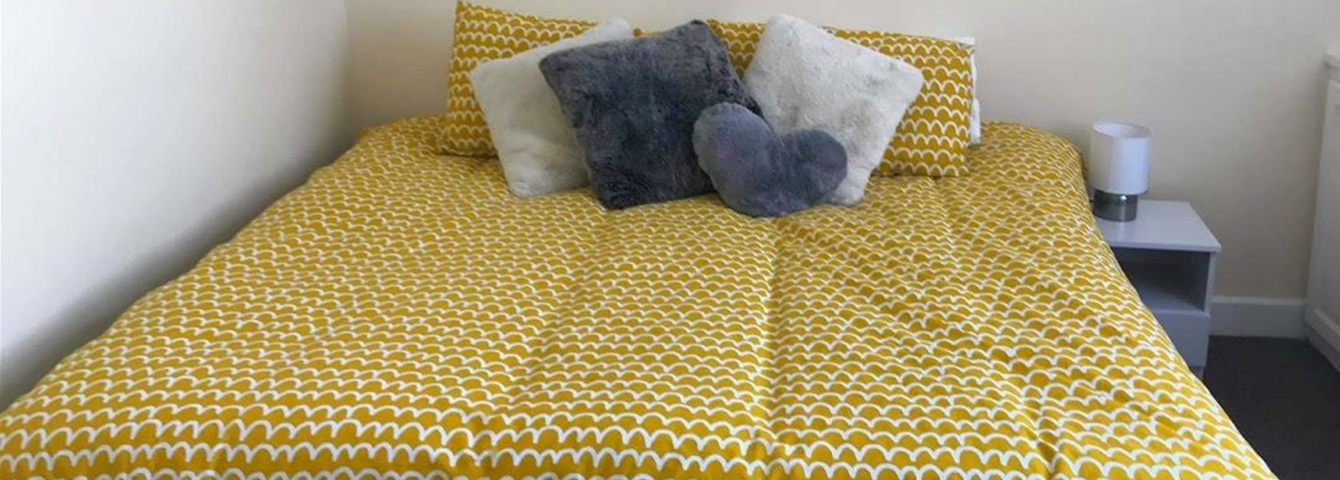
Room 1, 144 Cog Lane, Burnley, Lancashire, BB11 5BQ £100 Per week