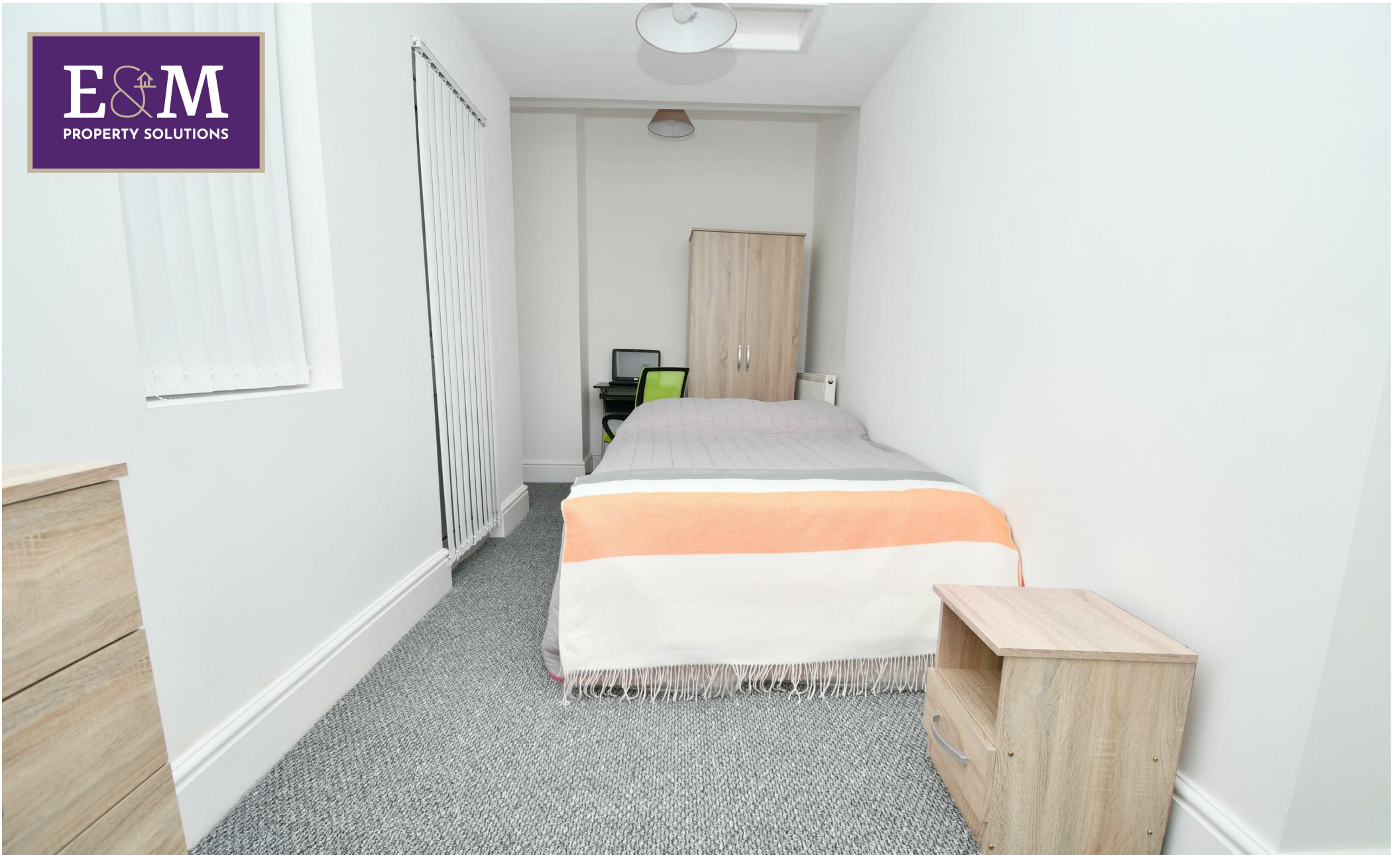
ROOM 2, 19 Netherby Street, Burnley, Lancashire, BB11 4NR £110 Per week