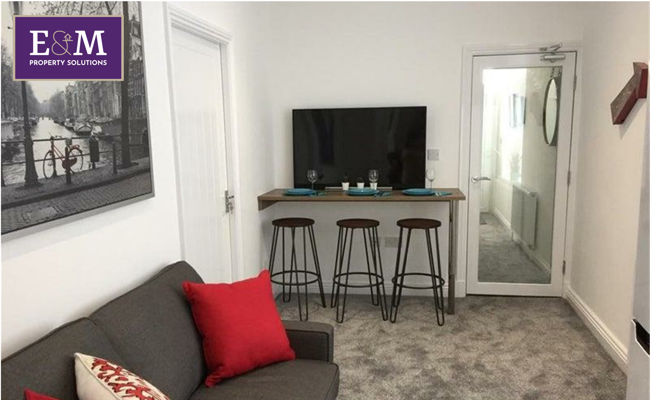
Room 2, 27 Ivan Street, Burnley, Lancashire, BB10 1ES £100 Per week