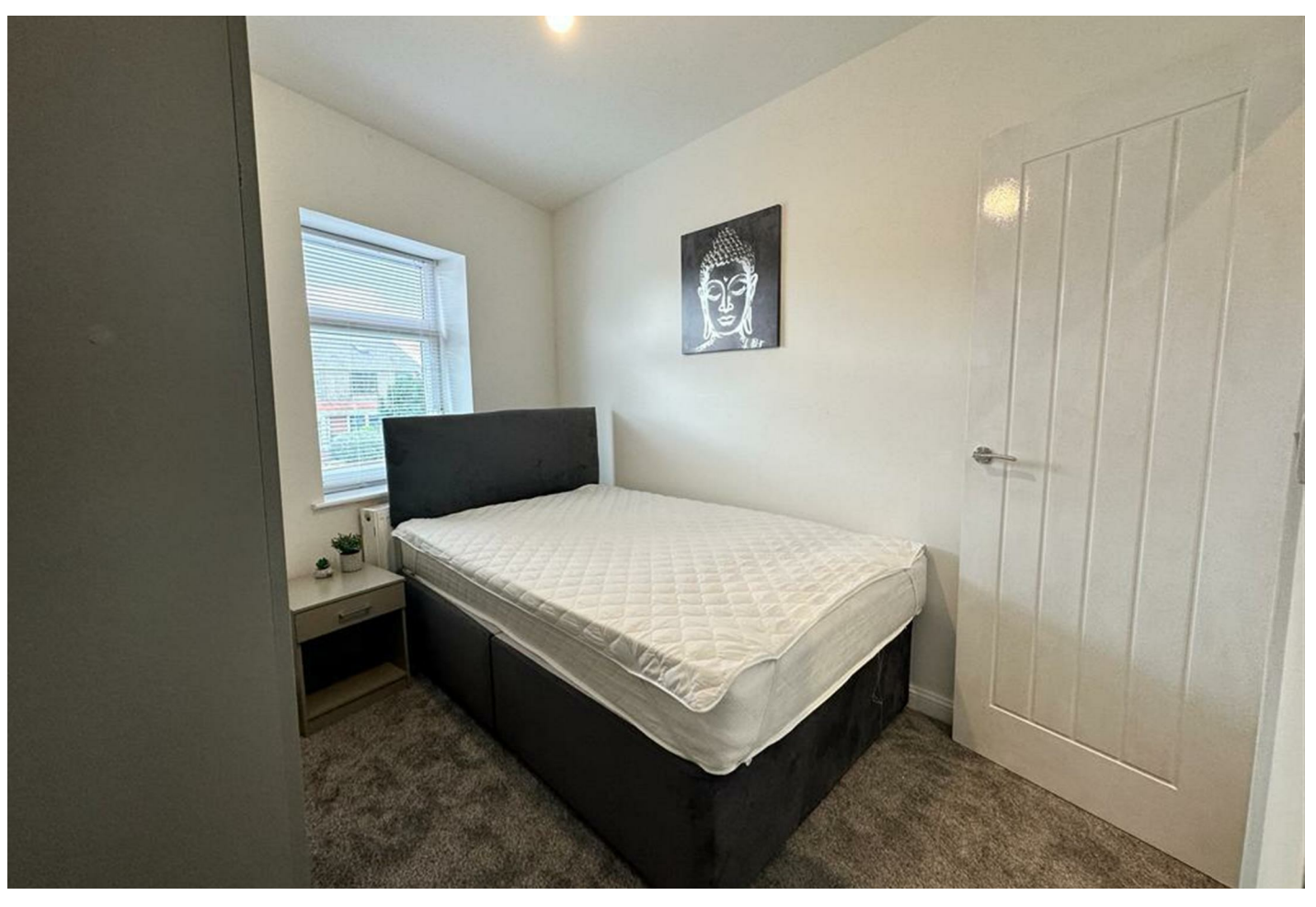
ROOM 6, 369 Brunshaw Road, Burnley, Lancashire, BB10 3HX