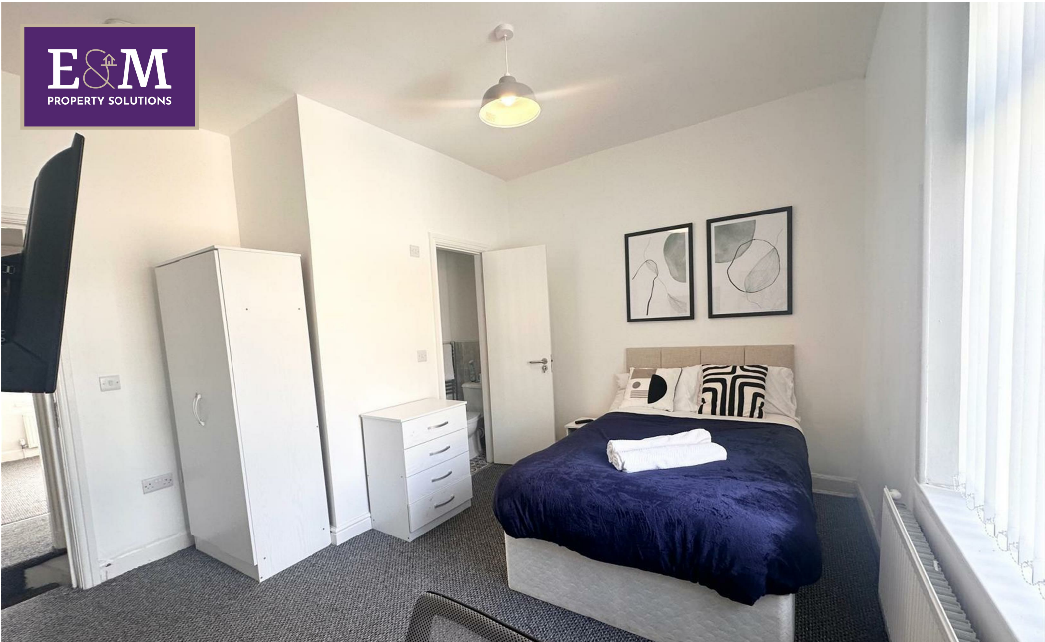
Room 3, 33 Lebanon Street, Burnley, Lancashire, BB10 4DF £120 Per week