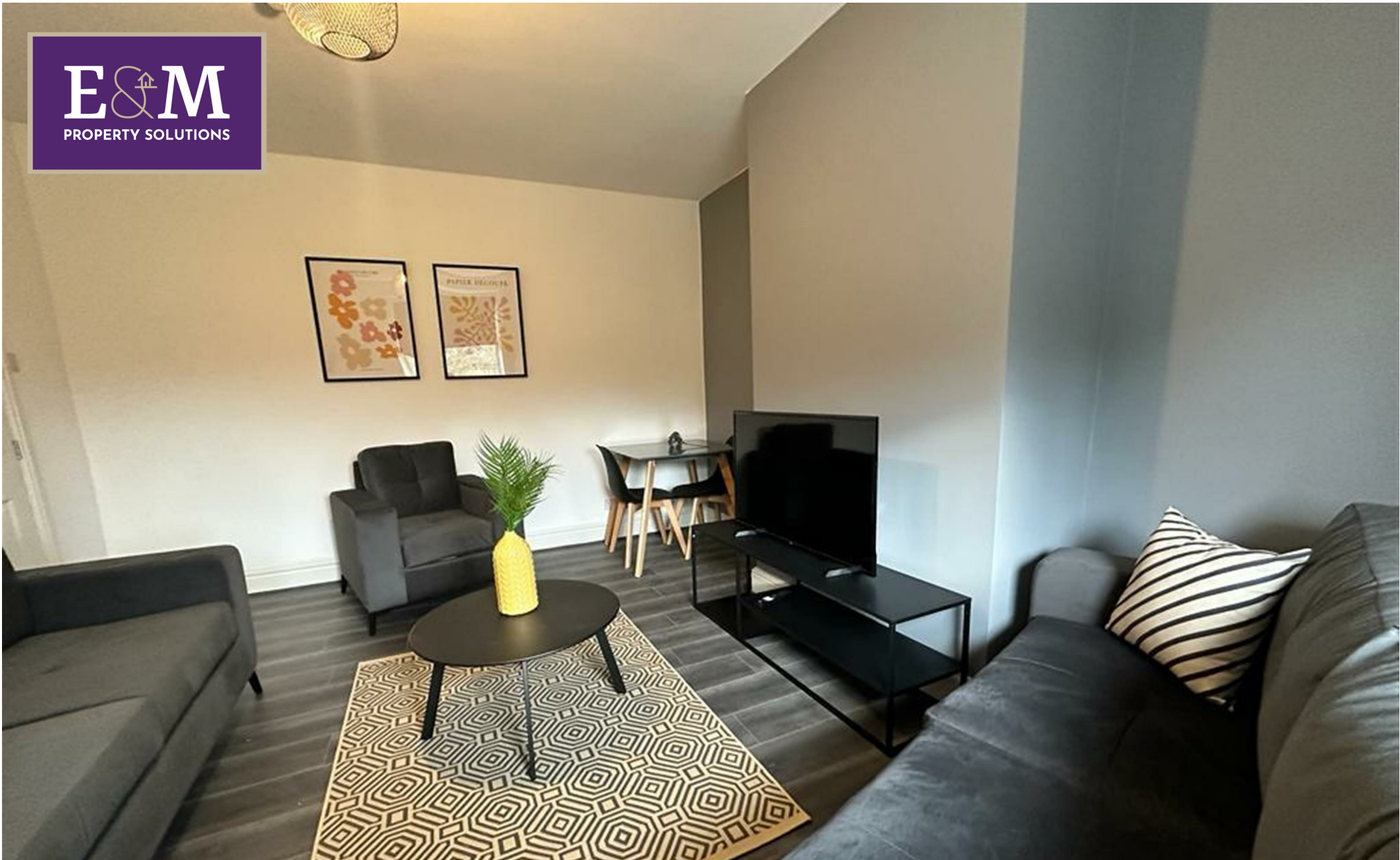
ROOM 1, 2-4 Collinge Street, Padiham, Burnley, Lancashire, BB12 7BA £89 Per week