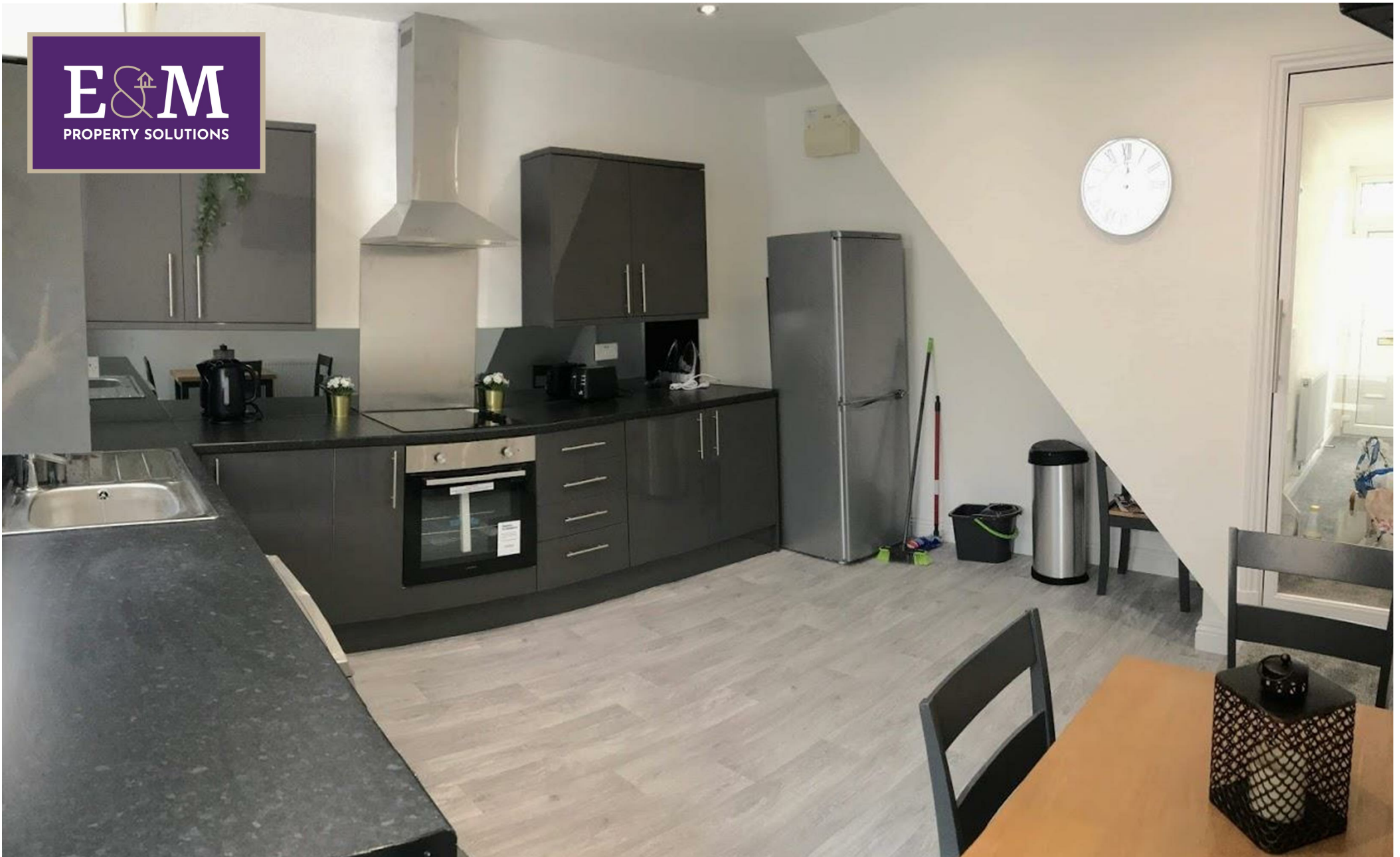
Room 3, 71 Burnley Road, Briercliffe, Burnley, Lancashire, BB10 2HG £90 Per week