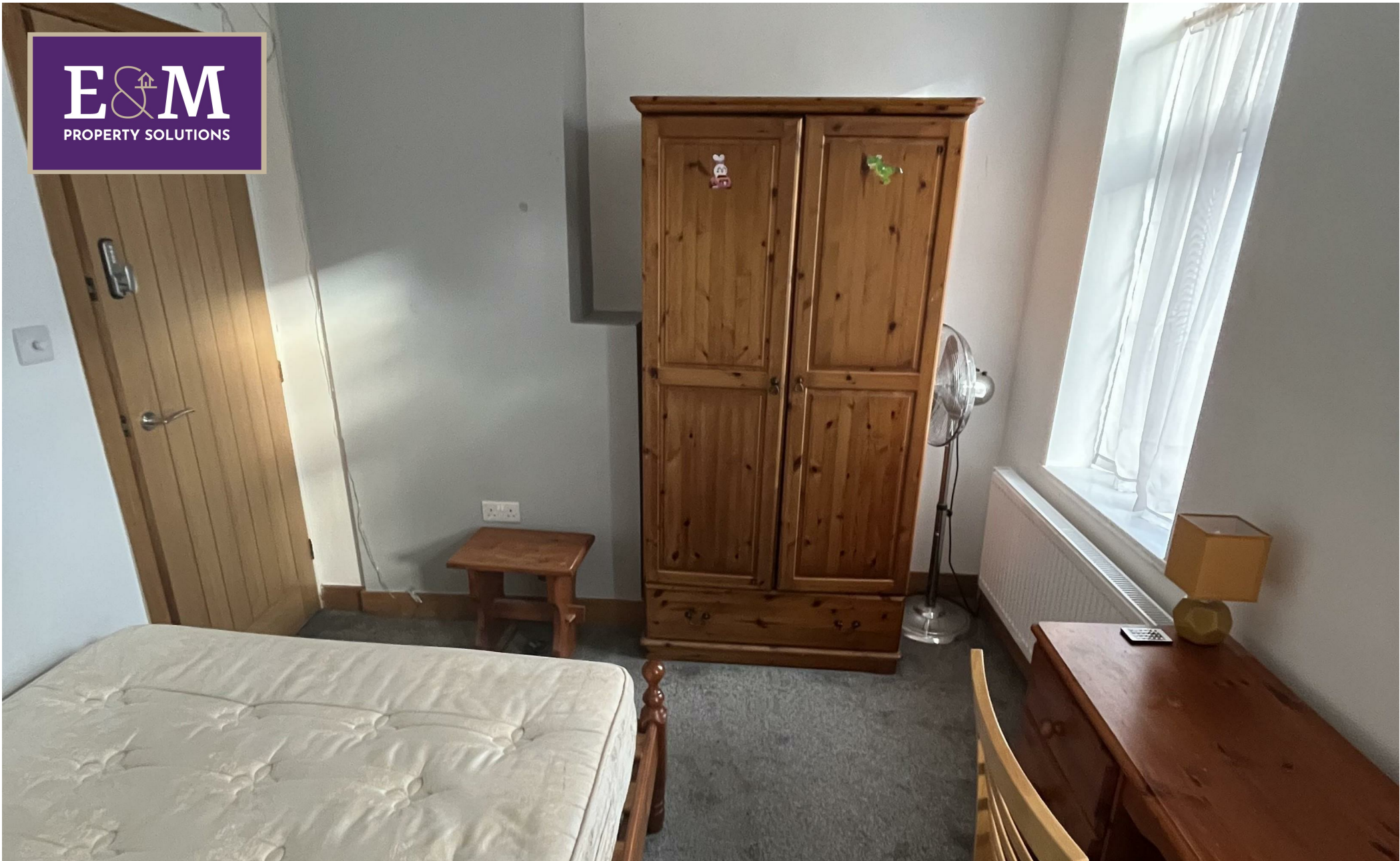
ROOM 3, 40 Herbert Street, Burnley, Lancashire, BB11 4JX £125 Per week