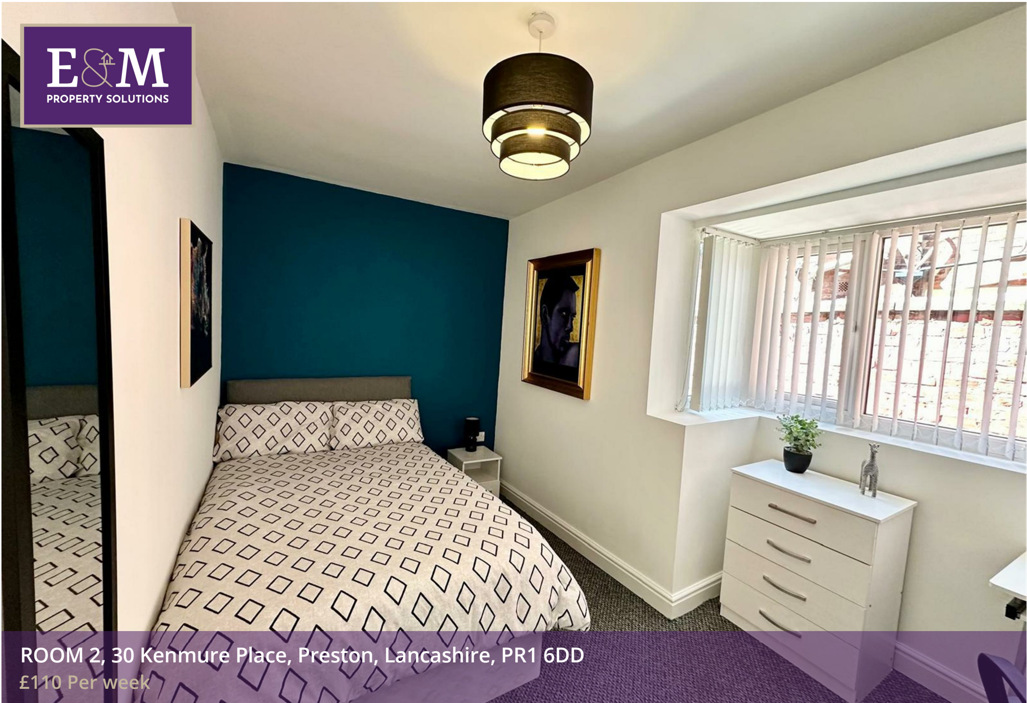
ROOM 2, 30 Kenmure Place, Preston, Lancashire, PR1 6DD £110 Per week