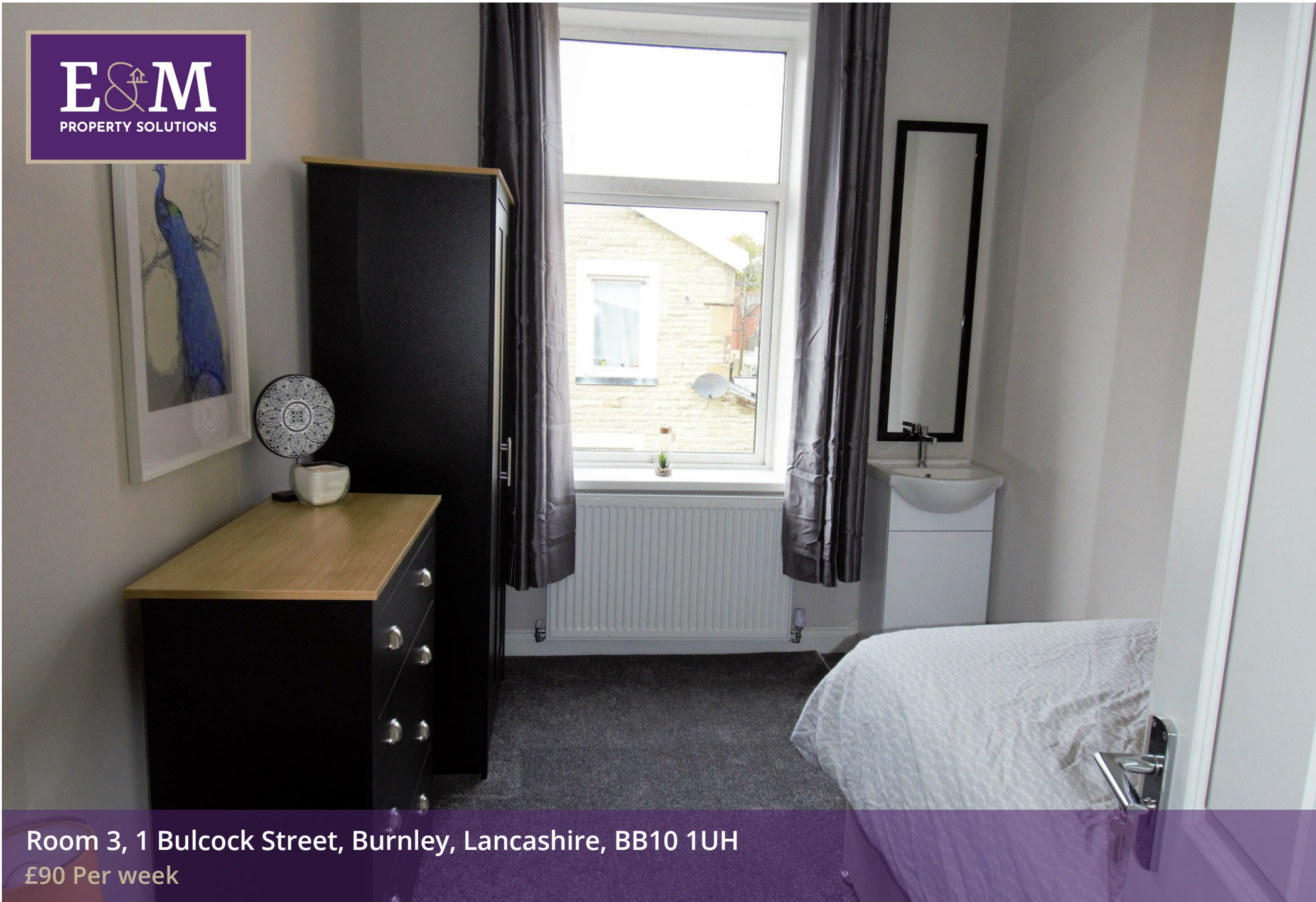
Room 3, 1 Bulcock Street, Burnley, Lancashire, BB10 1UH £90 Per week