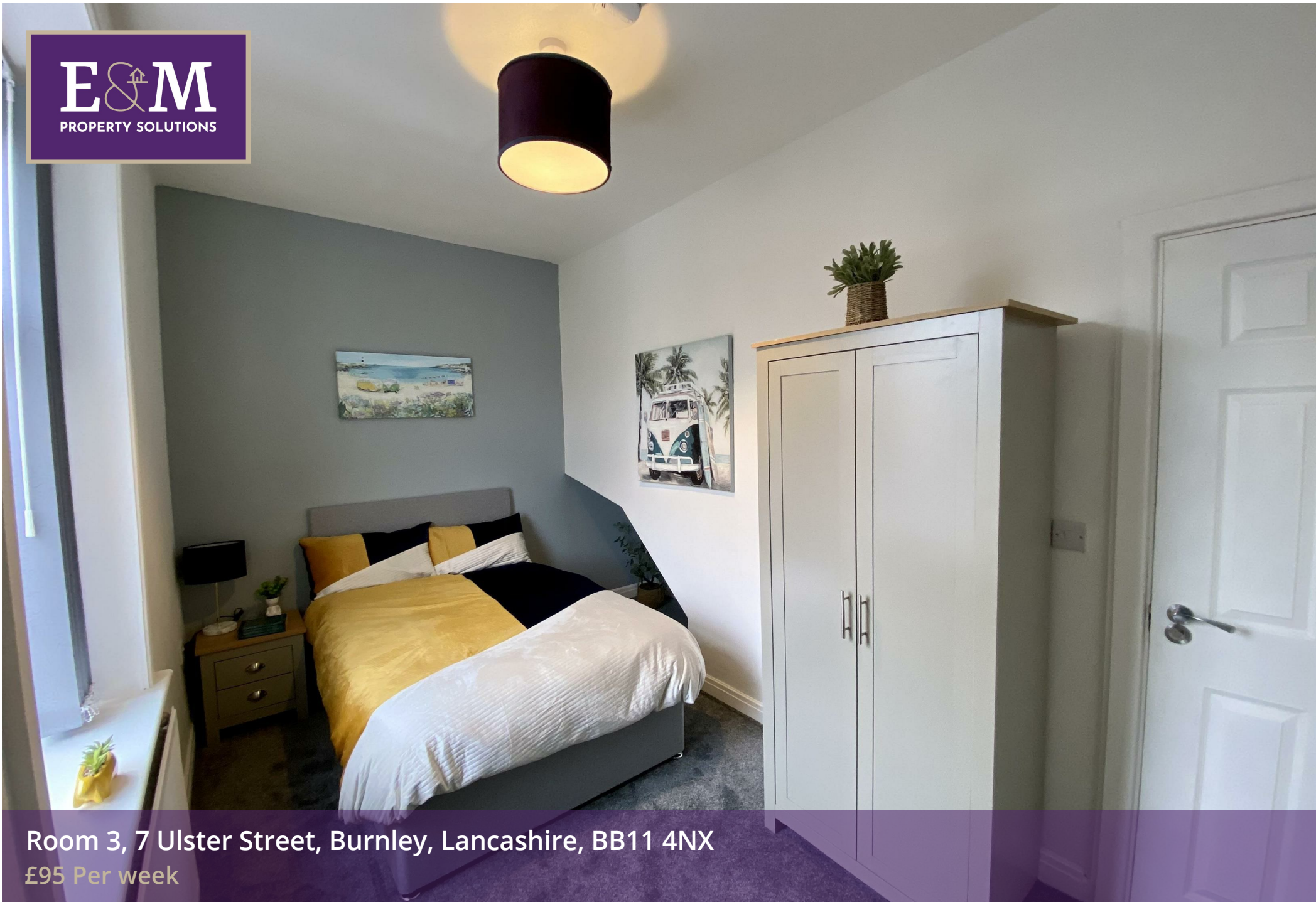
Room 3, 7 Ulster Street, Burnley, Lancashire, BB11 4NX £95 Per week