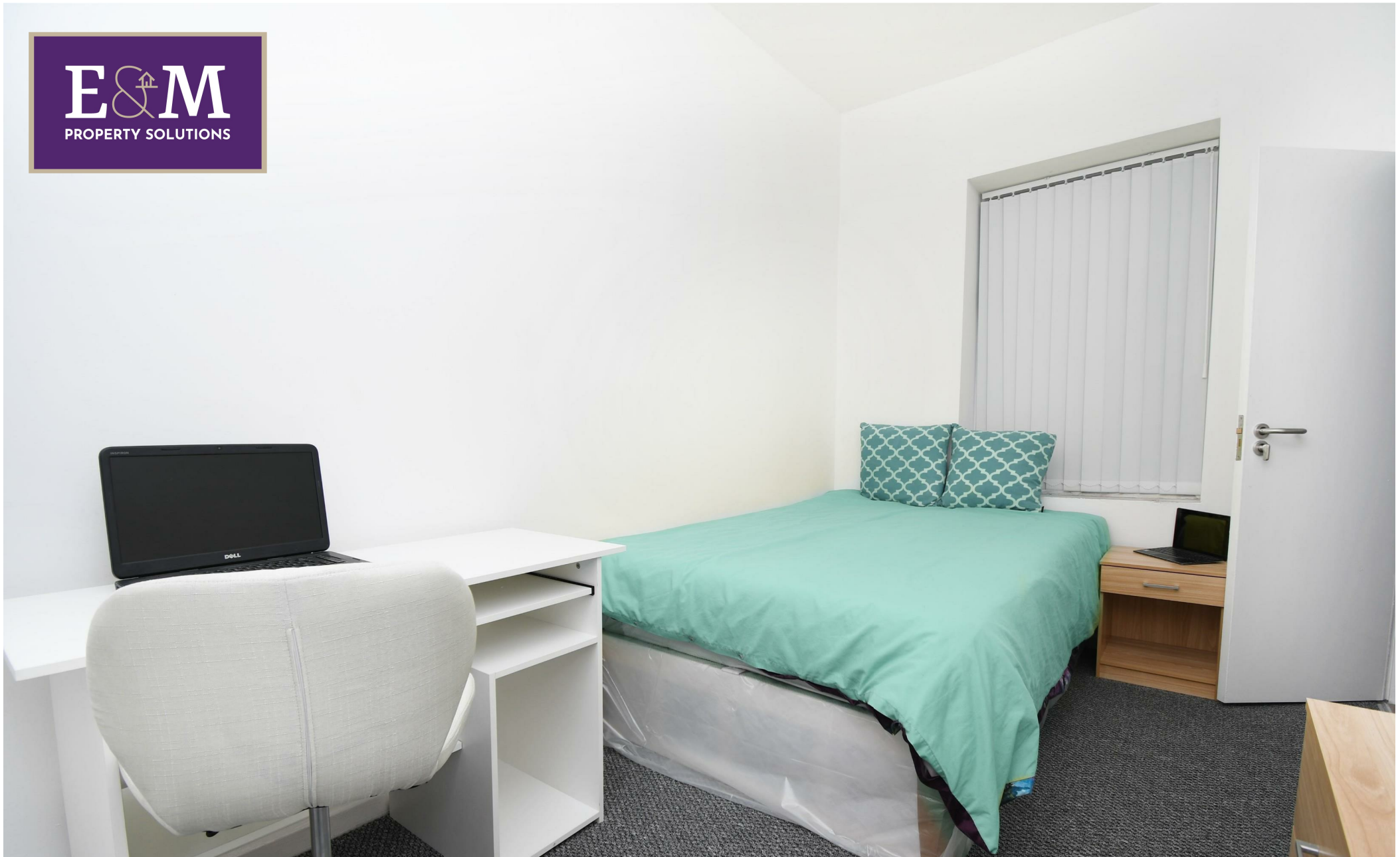
Room 1, 27 Nairne Street, Burnley, Lancashire, BB11 4BT £110 Per week