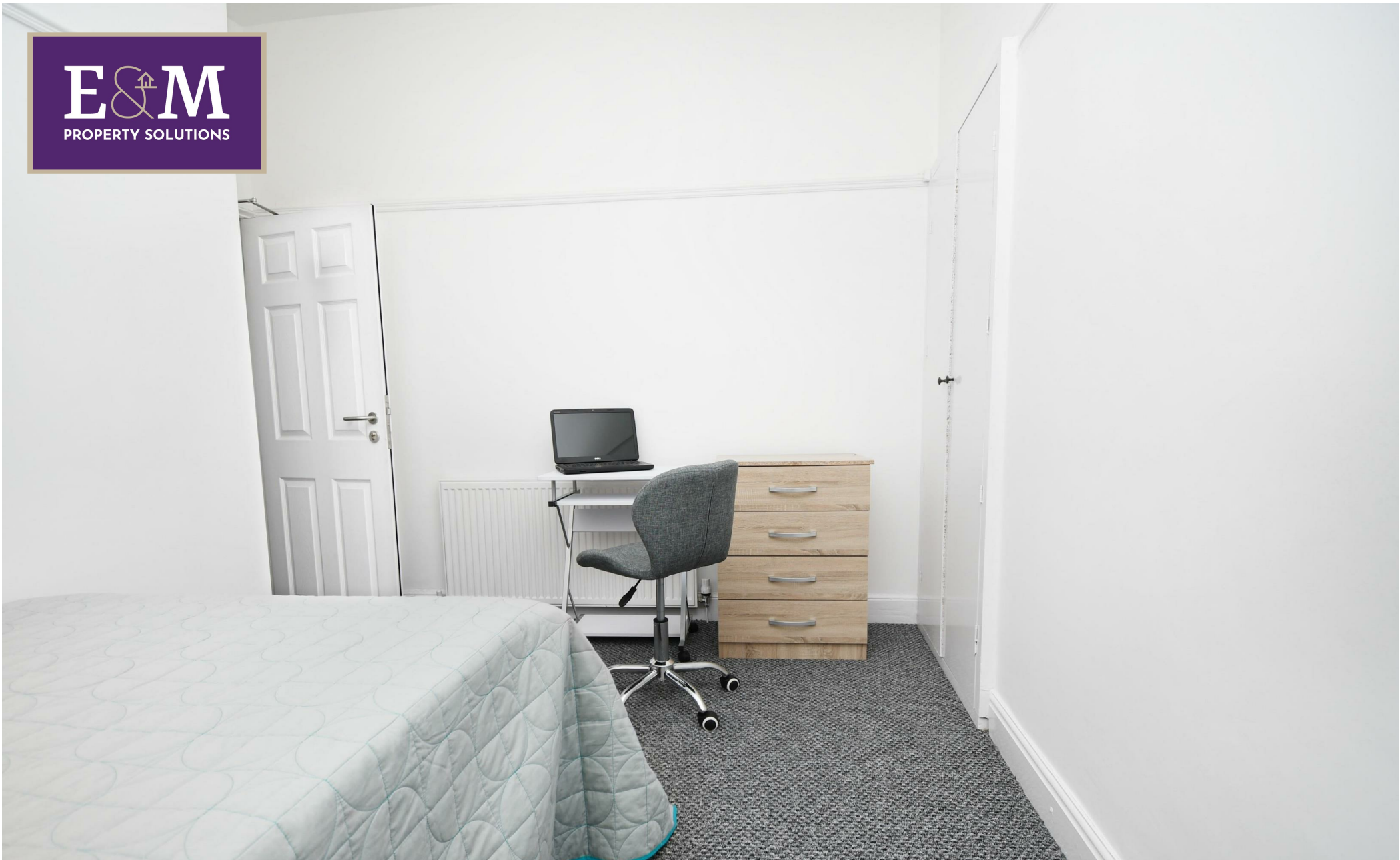
ROOM 3, 11 St. Ignatius Square, Preston, Lancashire, PR1 1TT £110 Per week