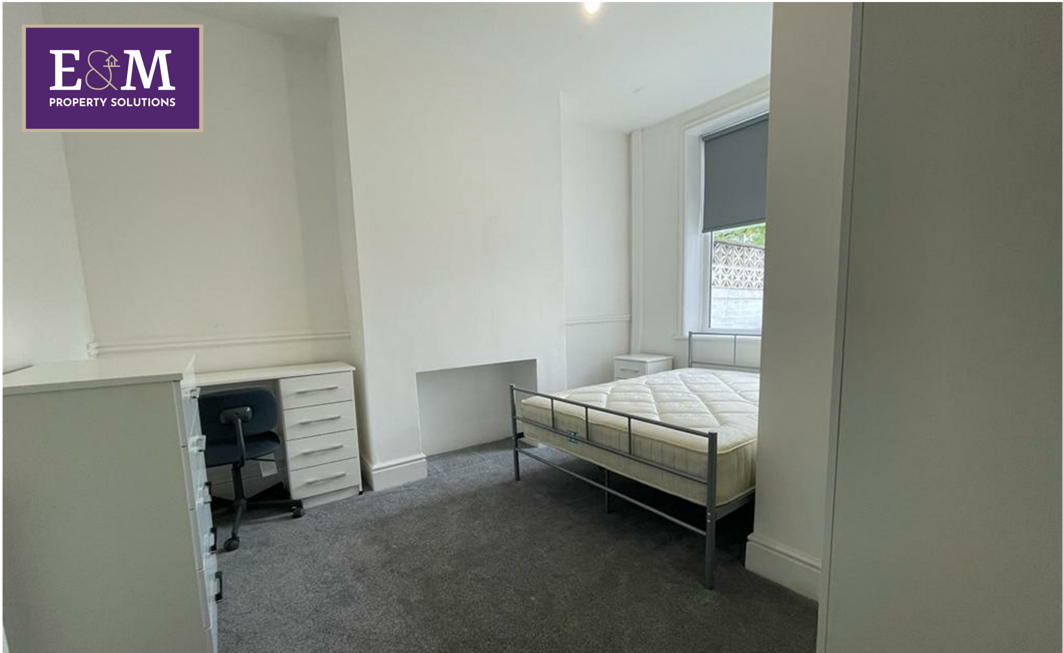
Room 2, 89 Nairne Street, Burnley, Lancashire, BB11 4PE £100 Per week