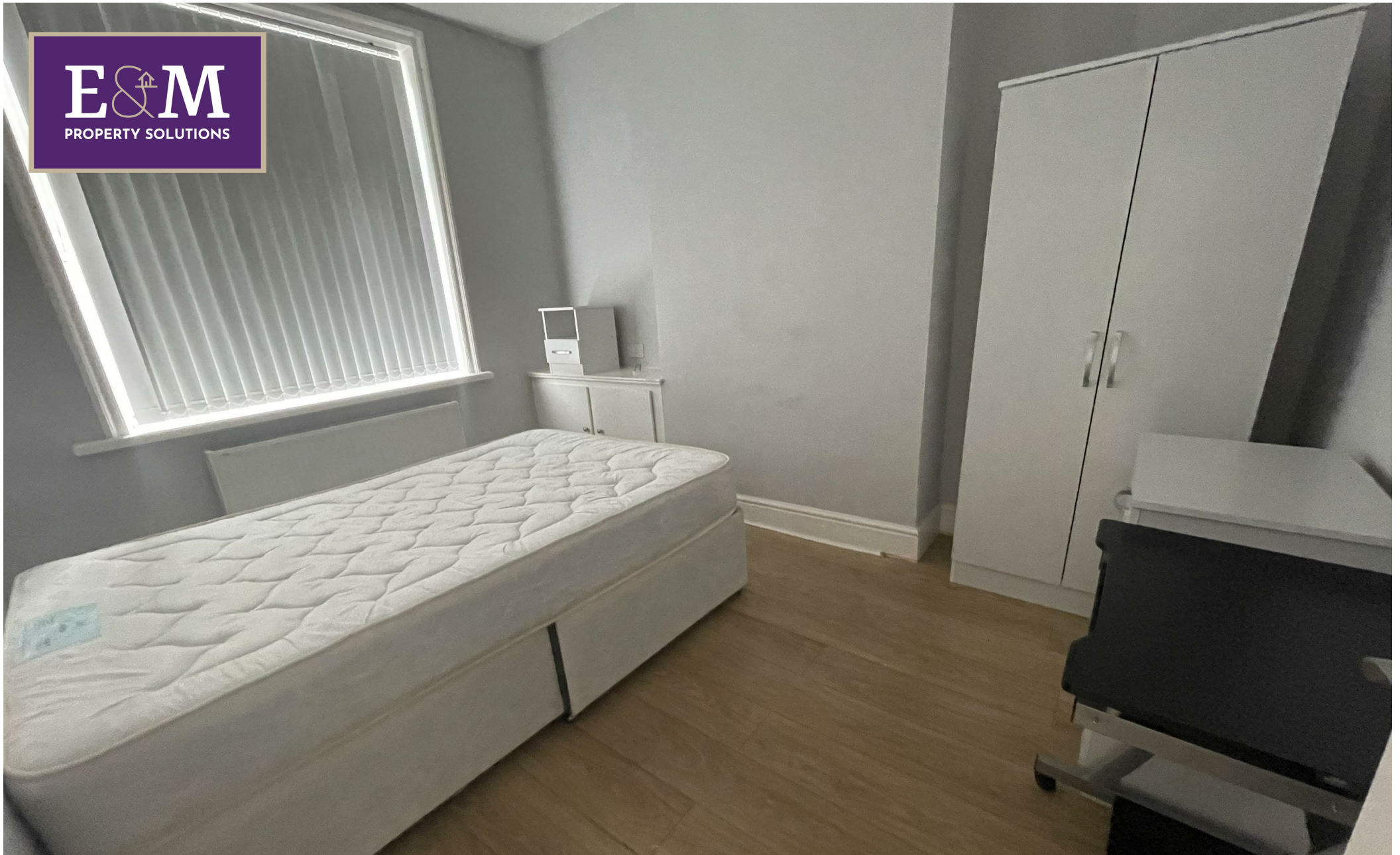
ROOM 1, 16 Harley Street, Burnley, Lancashire, BB12 6RJ £95 Per week