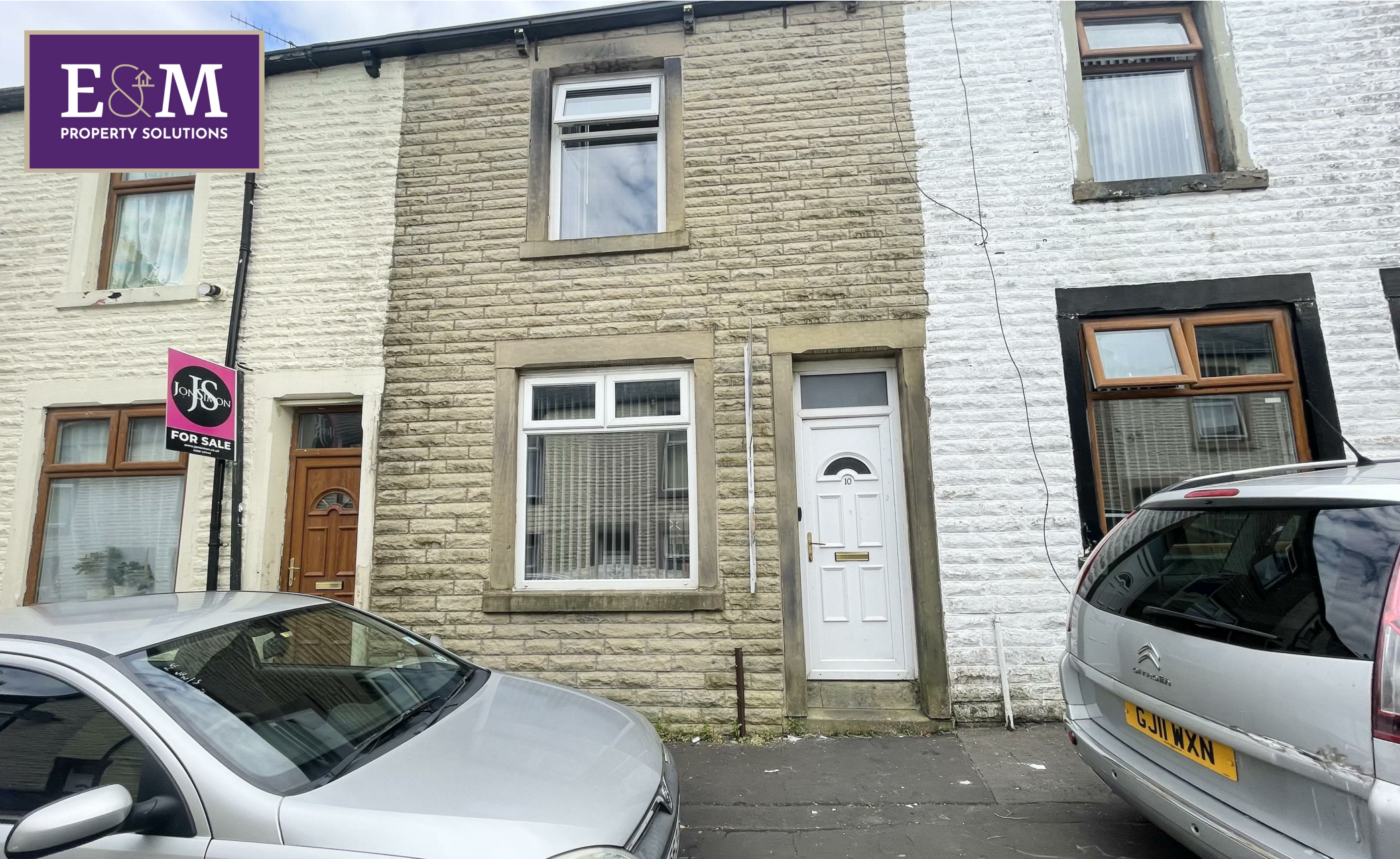
10 Grange Street, Burnley, BB11 4JZ Offers over £75,000