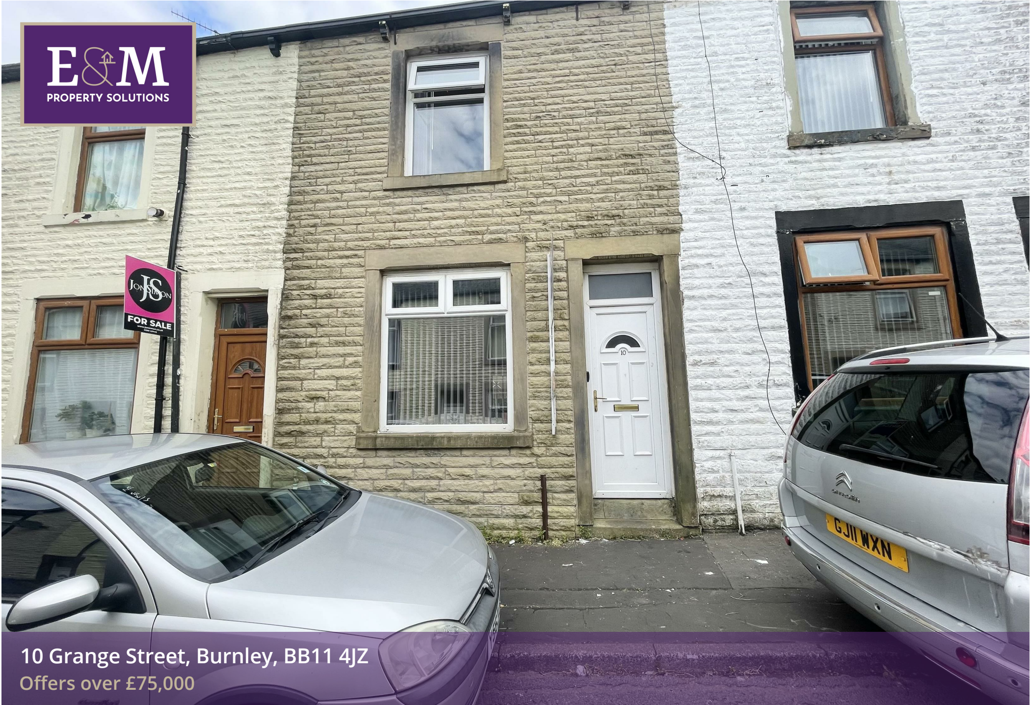
10 Grange Street, Burnley, BB11 4JZ Offers over £75,000